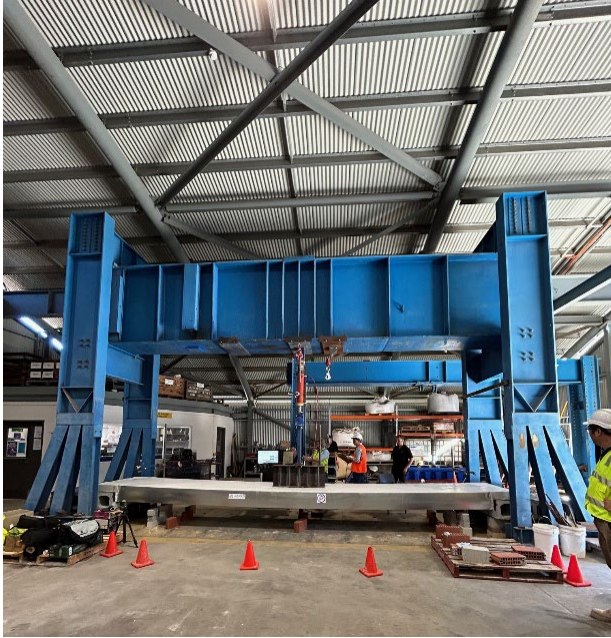
Above: Curtin University MDSB® Load Testing with SlimDek210®