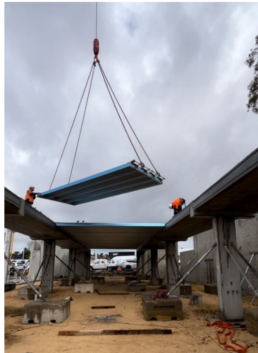
Above: Offsite Prefabrication MDSB® Assembly and Installation with SlimDek 210® | Fielders