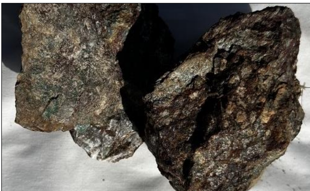
Figure 2: Lone Star Prospect sample TEM15 that assayed 4.11% Cu and 82.2 - 101 g/t Au (101 g/t Au = 3.2 Oz/t Au)

"We look forward to getting back on the ground at Tambourah as the summer months come to an end to start refining some drill targets for drilling this year."