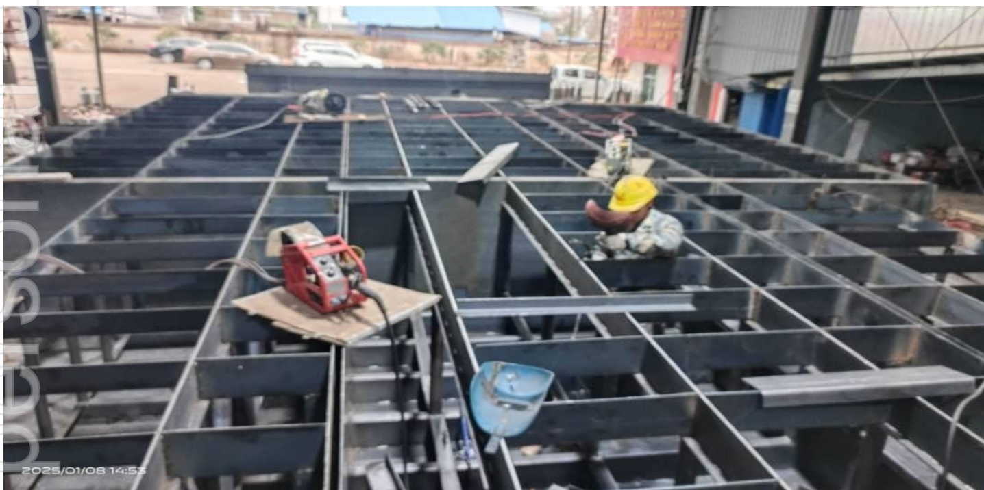
Above: Barge construction for the Orokolo Bay Project already underway.

The Project is fully permitted and offshore construction of equipment is already underway. Initial production targeted to commence late calendar 2025.