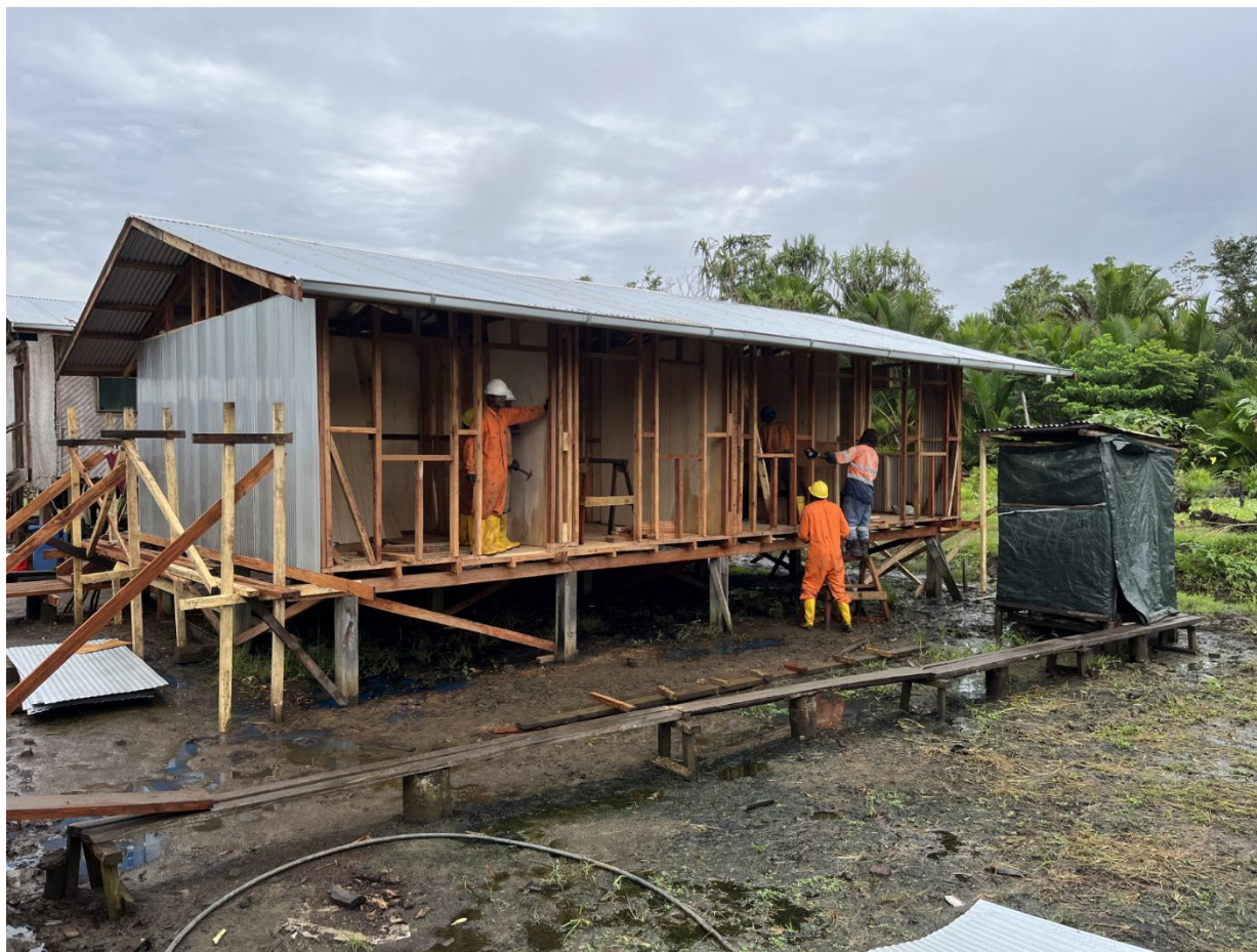
Above: Village campsite infrastructure under construction.

A summary of the material terms of the definitive agreements is annexed.