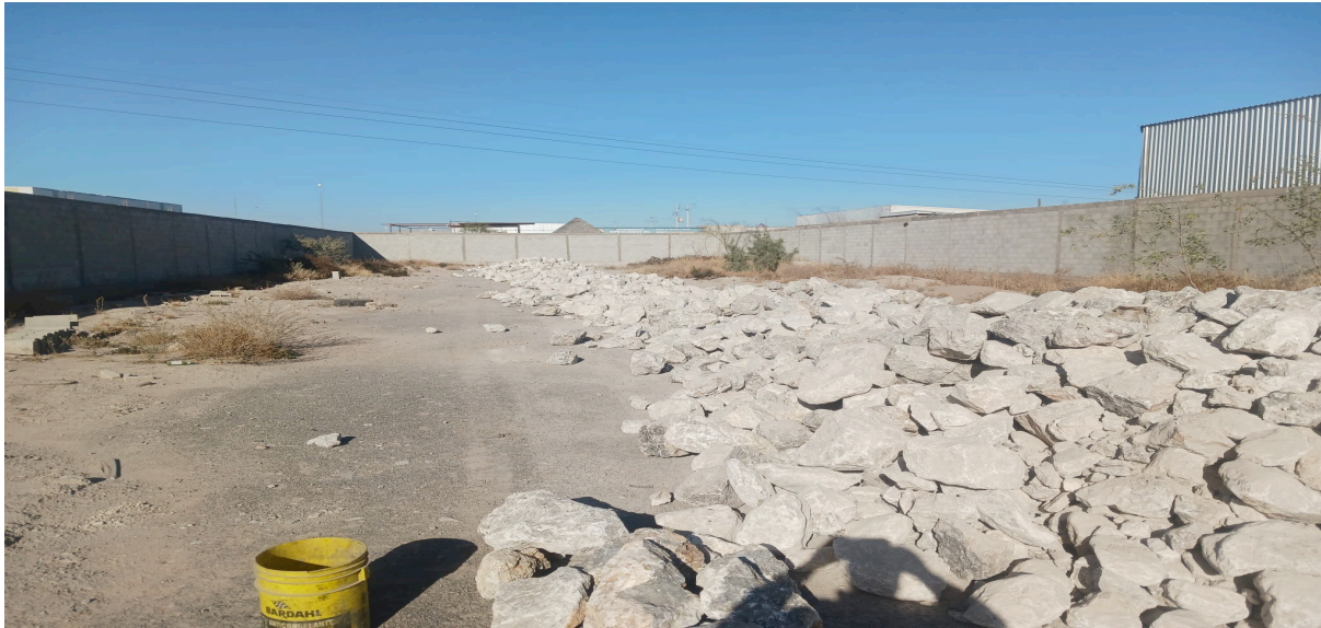
Photo 1 – Los Lirios material stockpile from which Samples SP-01, SP-02, and SP-03 were taken.

These samples SP-01, SP-02 and SP-03 returned assays of 29.17% Sb , 20.44% Sb , and 18.08% Sb , and have been sent for preliminary metallurgical test work at the Metallurgical Faculty at the Universidad Autonoma de Coahuila in Northern Mexico.