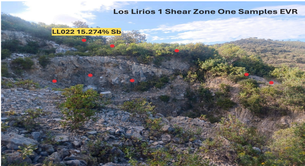
Photo 2 – Locations of Shear Zone One Samples at Los Lirios (red dots)

A further sample LL-022 taken from Shear Zone 1 at Los Lirios 3 returned an assay of 15.27% Sb . Further assay results are awaited.