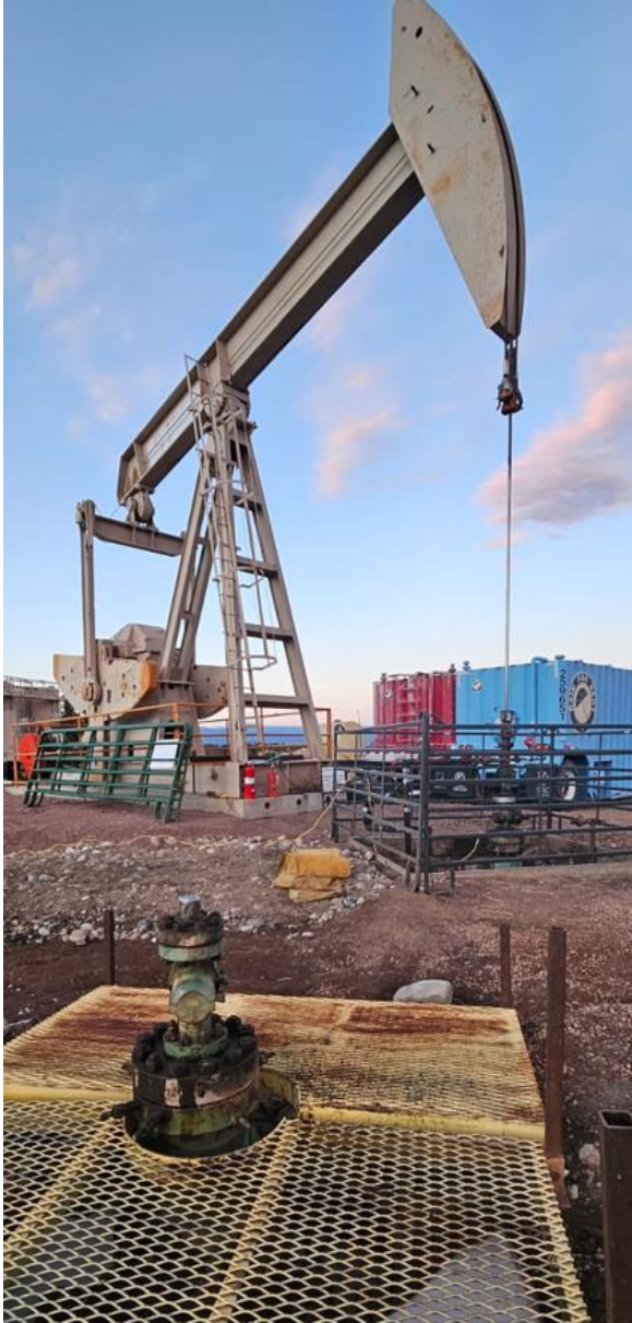
Image 1: Pathfinder #1 wellhead in the foreground ready for completion with Pathfinder #2 well on pump in the background