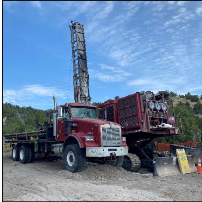
Figure 3: Alford Drilling MPD 1500 drill rig with support truck

Alford Drilling is a Tier One, family owned and operated drilling contractor based out of Elko Nevada. It is well credentialed and referenced and recently signed a contract with Golden Mile's wholly owned Arizona registered subsidiary, Gila Metallica LLC. The Company looks forward to the establishment of a good working relationship with Alford, who is also looking forward to the commencement of drilling operations. The RC rig is available to drill immediately on grant of the above-mentioned permits.