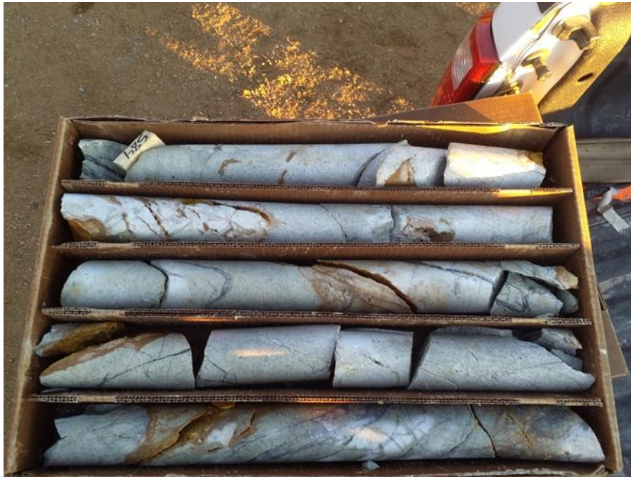
Core from GDD02 from 178 m to 181m downhole which assays 40 g/t Gallium

This announcement has been approved for release by the Board of G50.