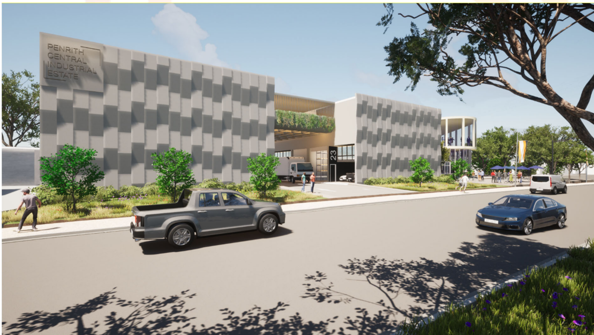
Artist's impression of Thornton, Penrith

The completion of this development will make a tangible contribution to Desane's future earnings.