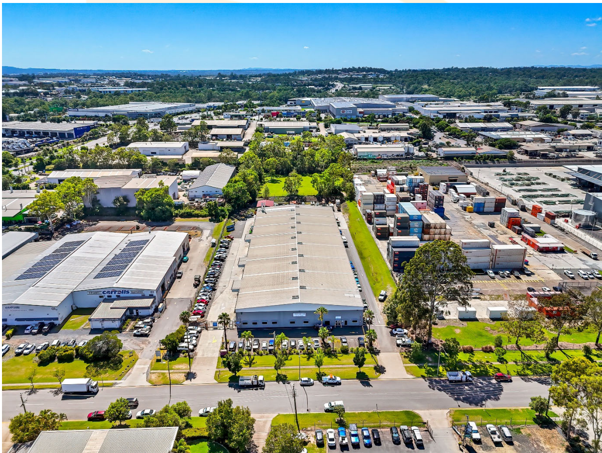
16 Industrial Avenue, Wacol (Brisbane)

Wacol is a core industrial suburb located only 20 km southwest of the Brisbane CBD with immediate access to major arterials, including the Ipswich and Logan Motorway. Brisbane Council houses their fleet vehicle maintenance division at the facility.