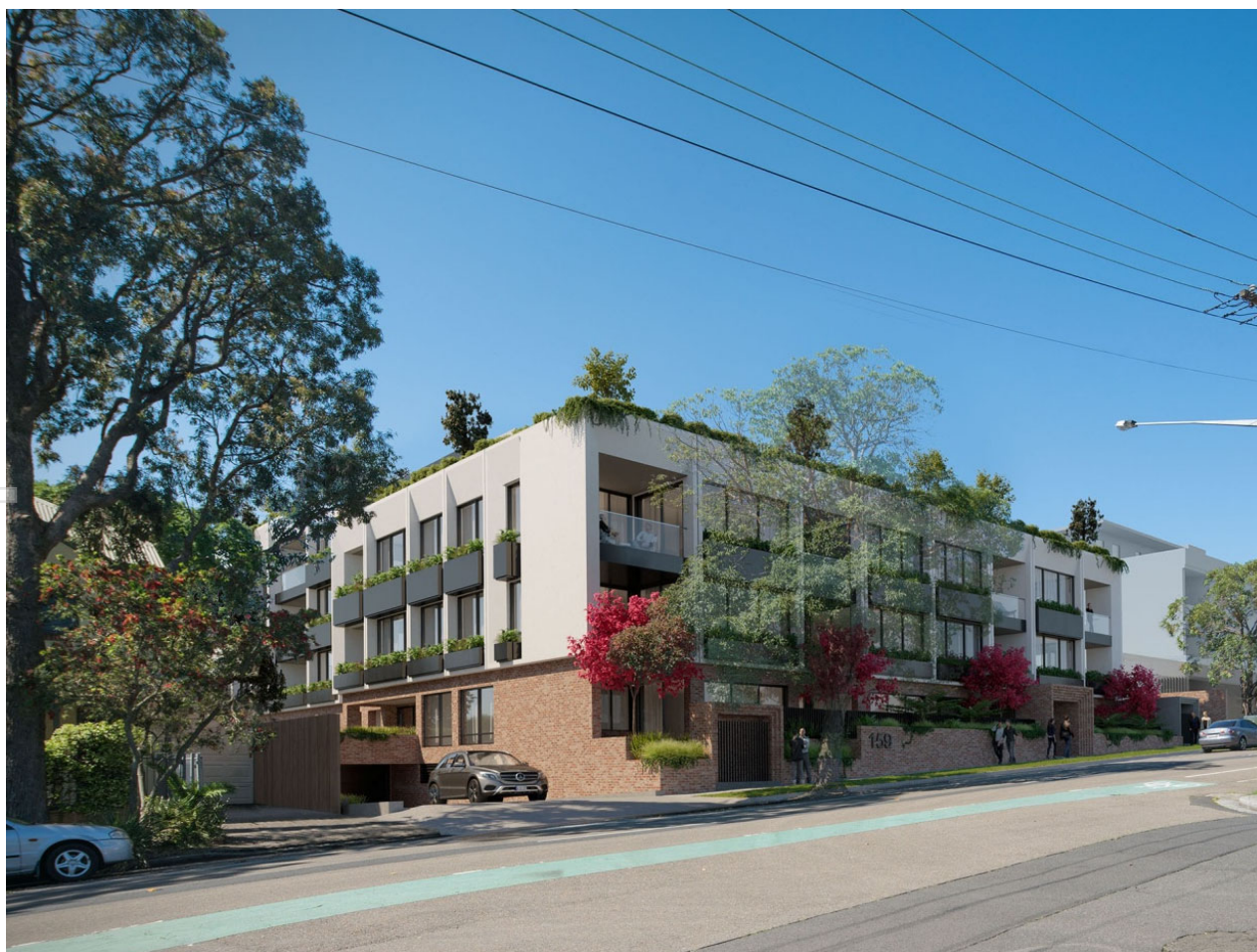
Concept image – 159 Allen Street, Leichhardt NSW