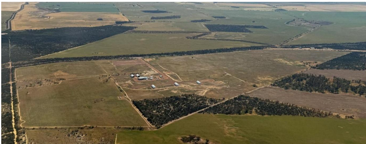
Fig 1. Aerial view of Wubin facility and surrounding landholding

With commercial terms now finalised for ongoing supply, this contract is expected to generate approximately $7 million in annual revenue. The comprehensive integration of our drill technology and energetics highlights our unique value proposition, optimizing blast-hole outcomes for our customers.