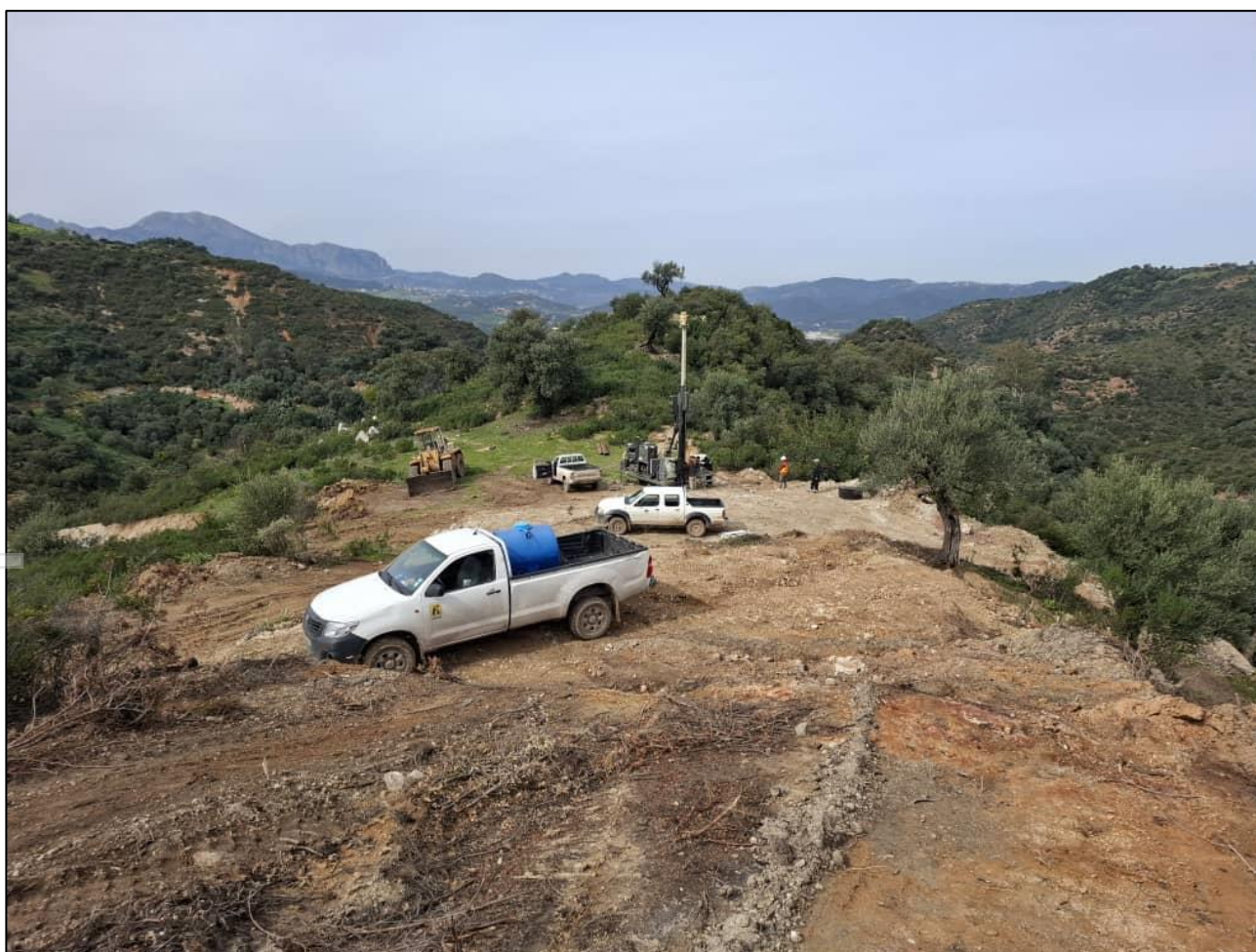
Figure 1: Drilling Rig onsite at Tala Hamza, Algeria