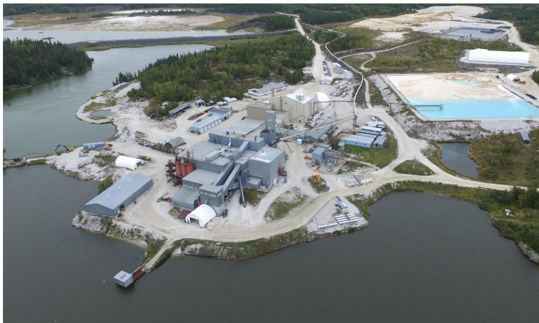
Figure 2: Tanco Mine and chemical plant site at Bernic Lake, Manitoba, (Source: Tanco website).

(Zimbabwe), and Sinclair (Australia). Australia's first commercial cesium mine, Sinclair, extracted its last cesium in 2019.