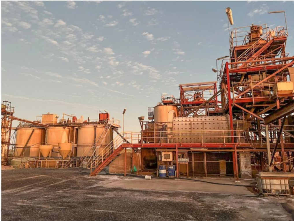
Figure 2 – Lorena Processing Facility