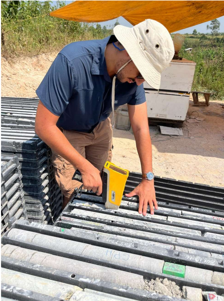
Figure 2: Field activities with XRF analyser