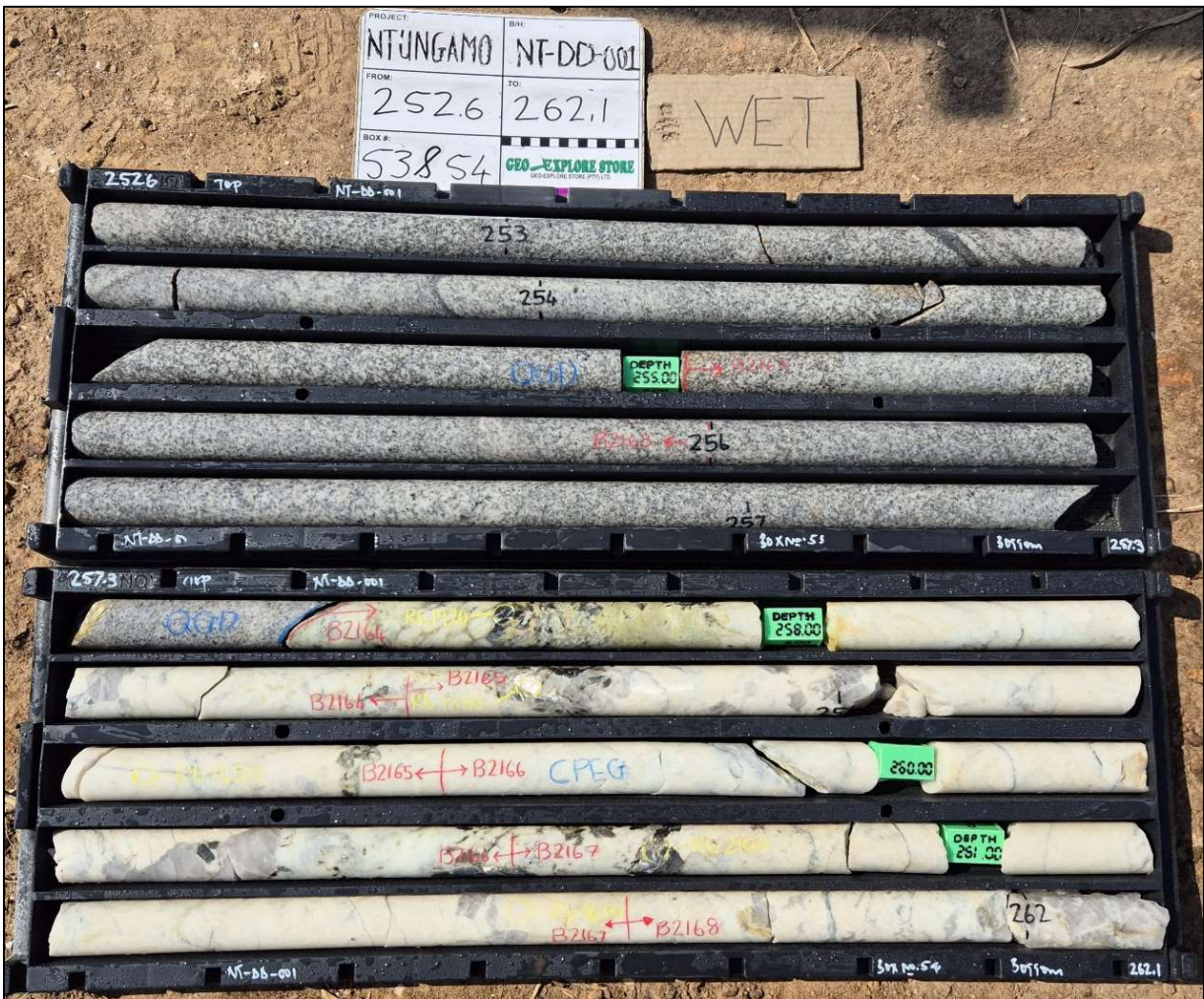
Figure 1: Photo of marked-up core from hole NT-DD-001 from 252.6m to 262.1m. Note the finer-grained, grey coloured quartz granitoid (QGD) on top, in contrast to the mostly white coloured, coarse-grained pegmatite (CPEG) at the bottom of the photo. XRF readings show an increase in anomalous rubidium values in the CPEG (mostly within the mica and feldspar minerals). Spot readings from the XRF are marked in yellow on the core where relevant.

Director of Blaze Minerals Mathew Walker commented "These early XRF results validate our targeting strategy at Ntungamo, with strong rubidium and REE indications across significant widths. We're excited to accelerate sampling and drilling to unlock the project's potential."