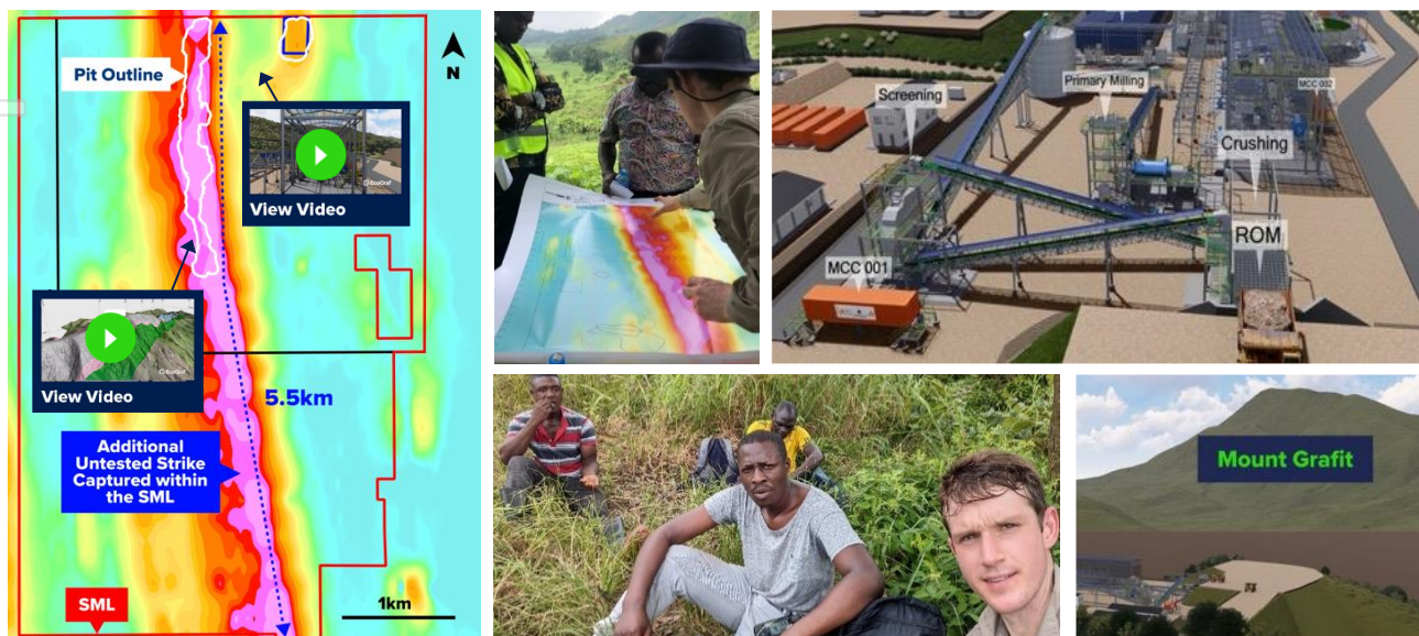
The SML application with Electromagnetic image (left), geological team at Mount Grafit Peak and FEED of processing plant

The grant of the SML is a major milestone in the development of Epanko and a key requirement for the financing process to support the stage 1 development, which includes the 73,000 tpa graphite processing plant 1 .