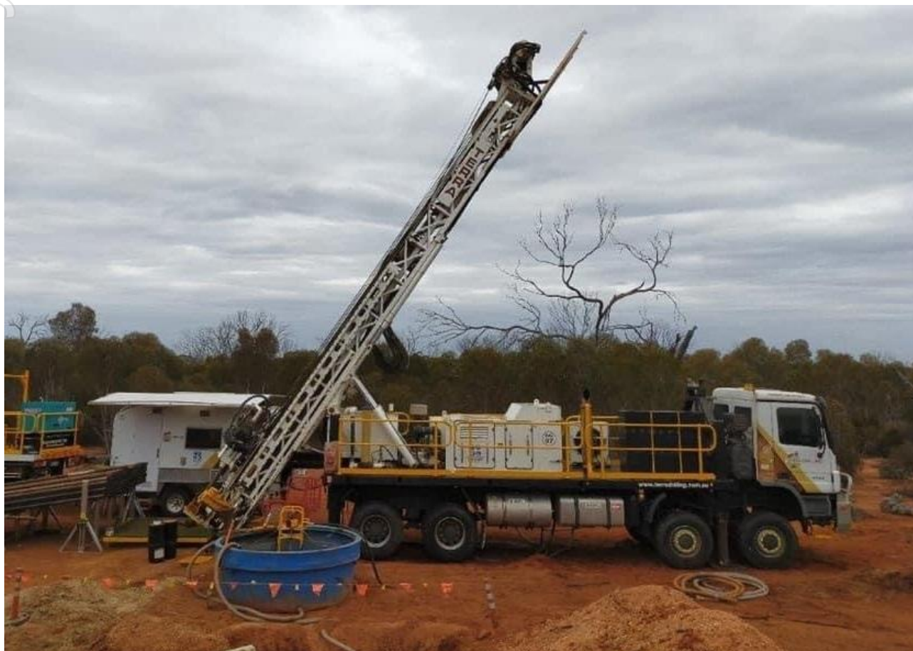
Figure 2: Terra Drilling diamond drilling rig on site at Lady Grey Project Mt Holland

The modelled conductor plate under MLEM Line #1 is being drilled from the existing historical access and grid lines which have been refurbished. The modelled conductor plate is 114m below surface and dips to the east and is being drill tested with diamond drill holes as proposed in Figure 3.