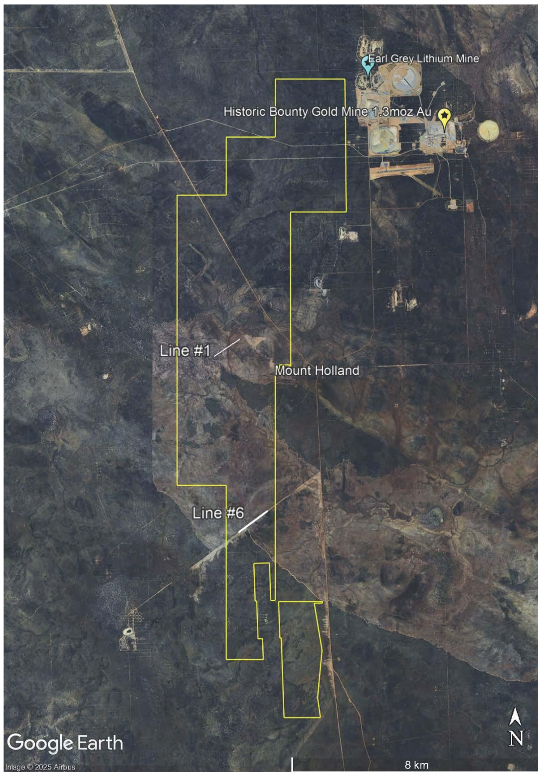
Figure 1: Lady Grey Project tenement E77/2143 outline (yellow), MLEM Drill Lines (white) overlay on a Google Earth satellite photo image.