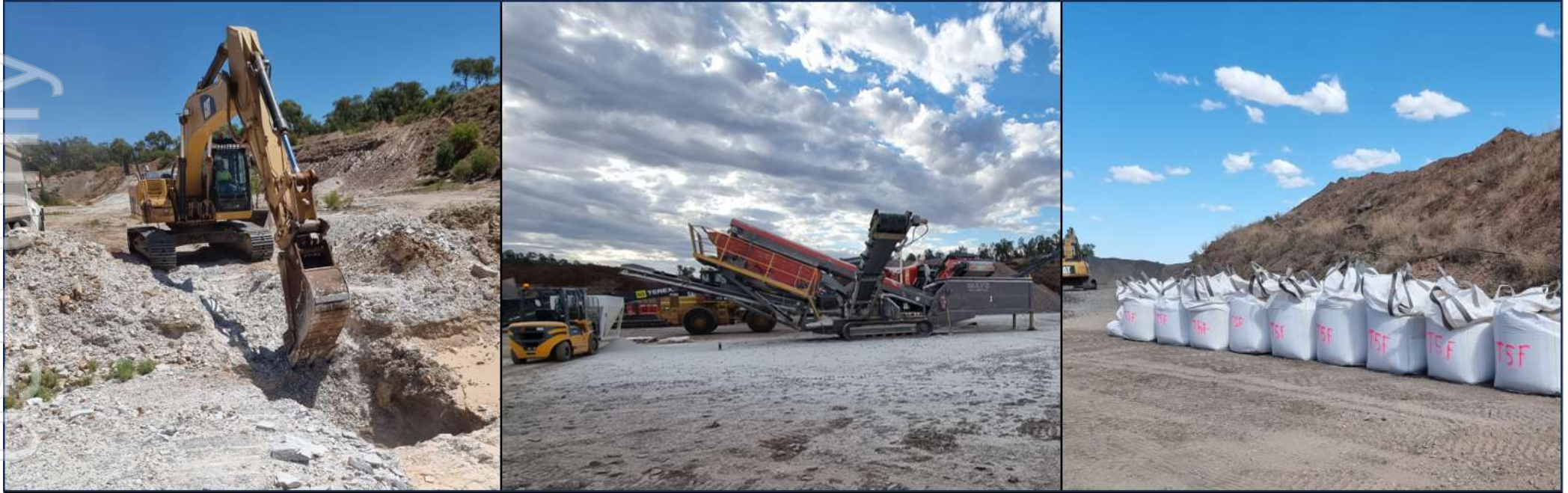
Figure 1: Left – Excavating the bulk sample from trench T7 and loading directly into a waiting truck; Middle – Sample being loaded into the crushing and screening plant in Condobolin, where the sample was crushed to -40mm and screened to separate the -7mm fines; Right – Sample awaiting transport after being loaded into bulk bags for transport to TOMRA Ore Sorting Solutions, Sydney for full-scale ore sorting testwork before downstream concentrating in pilot-scale processing plants at ALS Perth and then ALS Burnie.