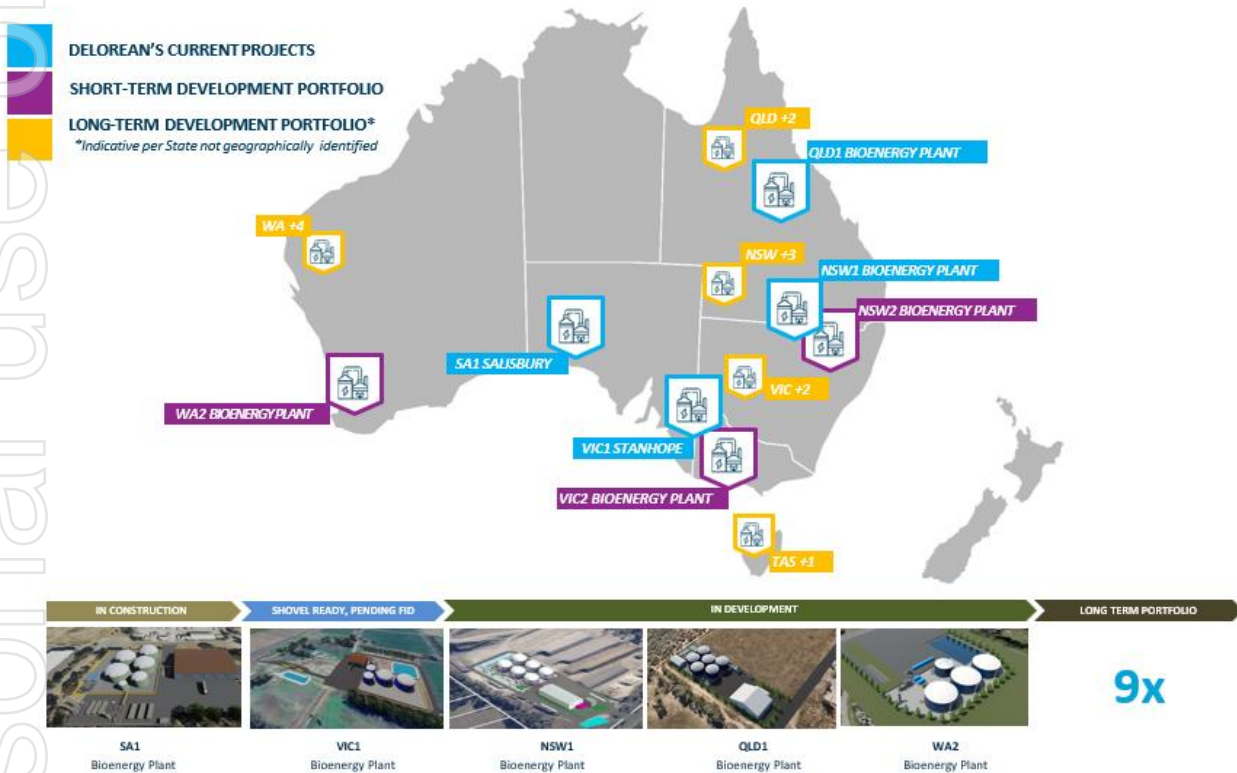
Projected Biomethane Production from Delorean Bioenergy Projects

Delorean's projects replace natural gas with biomethane, driving decarbonisation in hard-to-abate sectors through existing infrastructure.