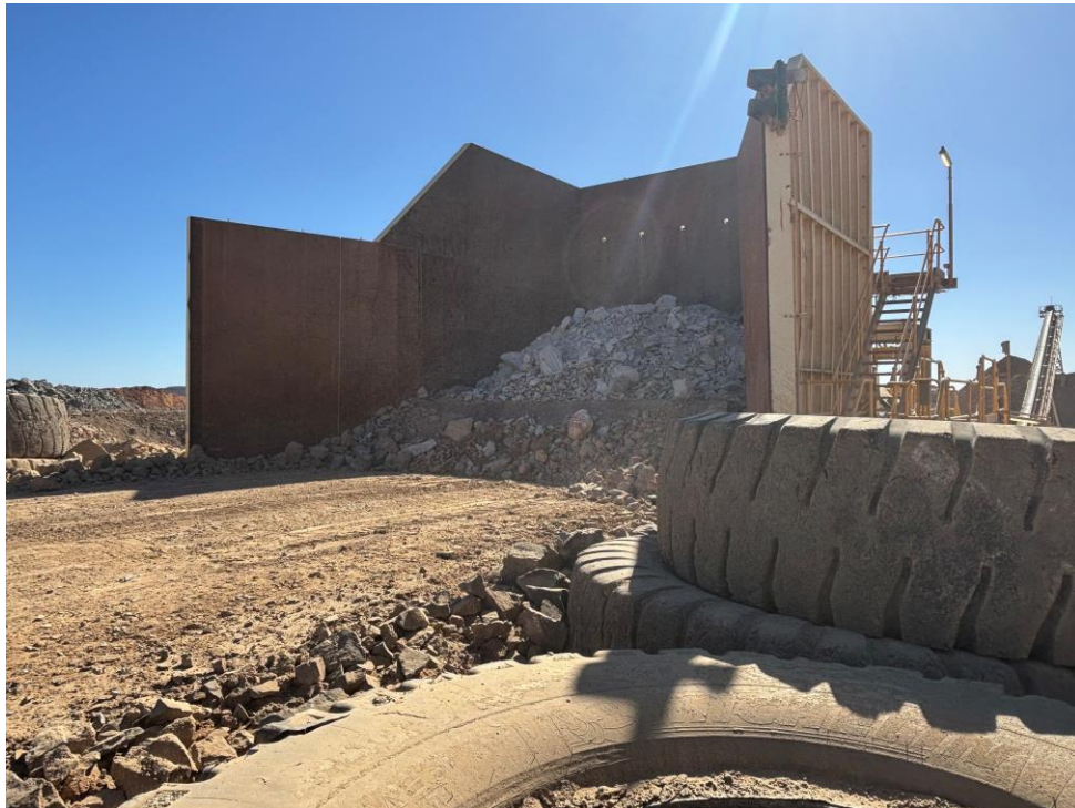
Figure 1 - First bucket of Brightstar ore loaded into the crusher at the Laverton Mill

The commencement of production realises a key step in Brightstar executing on its accelerated CY25 Laverton production strategy. Brightstar has executed an OPA with Genesis for Brightstar to deliver, sell and process up to 500,000 tonnes at Genesis' Laverton Mill from its Laverton Hub over the course of CY25 and Q1 CY26. The Company expects sufficient ore to be delivered to Mt Morgans consistently throughout the term of the OPA for regular processing parcels to deliver consistent cashflow throughout the year, which supports the Company's aggressive exploration and development plans across the Menzies, Laverton and Sandstone Hubs.