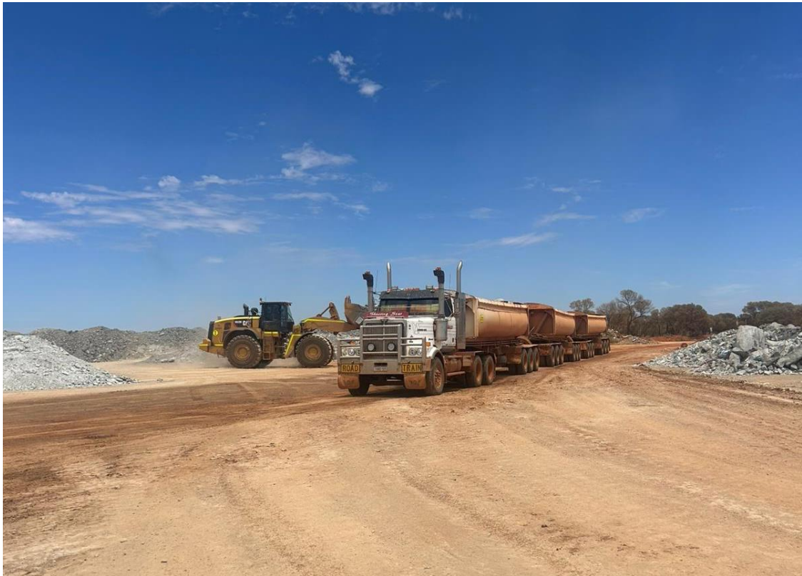
Figure 2 – Haulage activities from Second Fortune underground operation