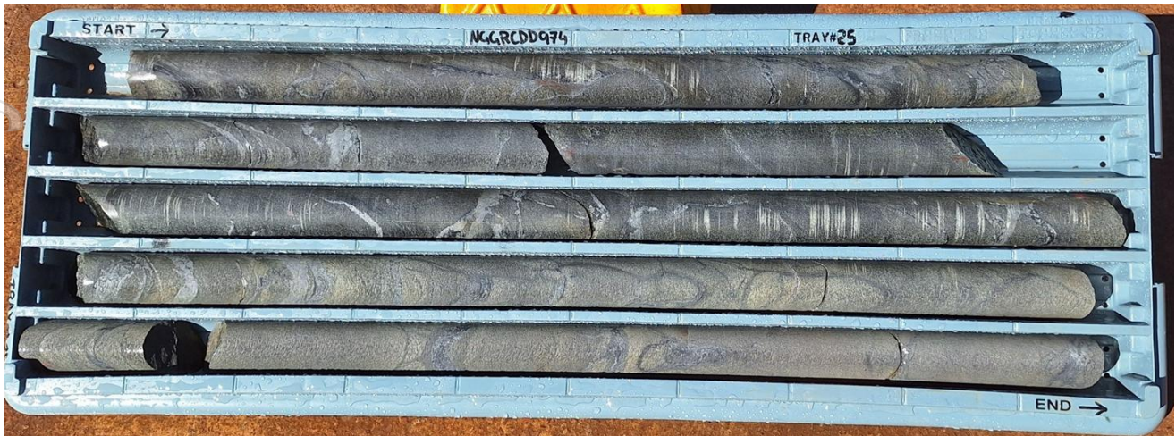
Tray 25 (253.11m – 257.51m) - Sheared and bleached mafic, quartz carbonate veins.