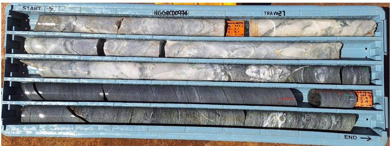
Tray 27 (261.66m – 265.97m) – large quartz-carbonate vein. Sheared and bleached mafic. Footwall to structure at approximately at 263.8m