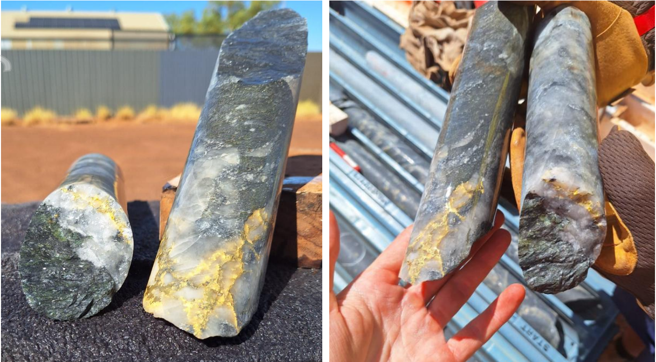
Photos 1 & 2: Visible Gold in Quartz - Carbonate Vein intersected at 252m down hole in NGGRCDD974 within a broader 16m wide shear zone

New Murchison Gold Limited ( ASX:NMG ) (“ NMG ” or the “ Company ”) is pleased to provide an update on diamond drilling activities at the Crown Prince Gold Project ( Crown Prince ) at the Company’s flagship Garden Gully Gold Project near Meekatharra, Western Australia.