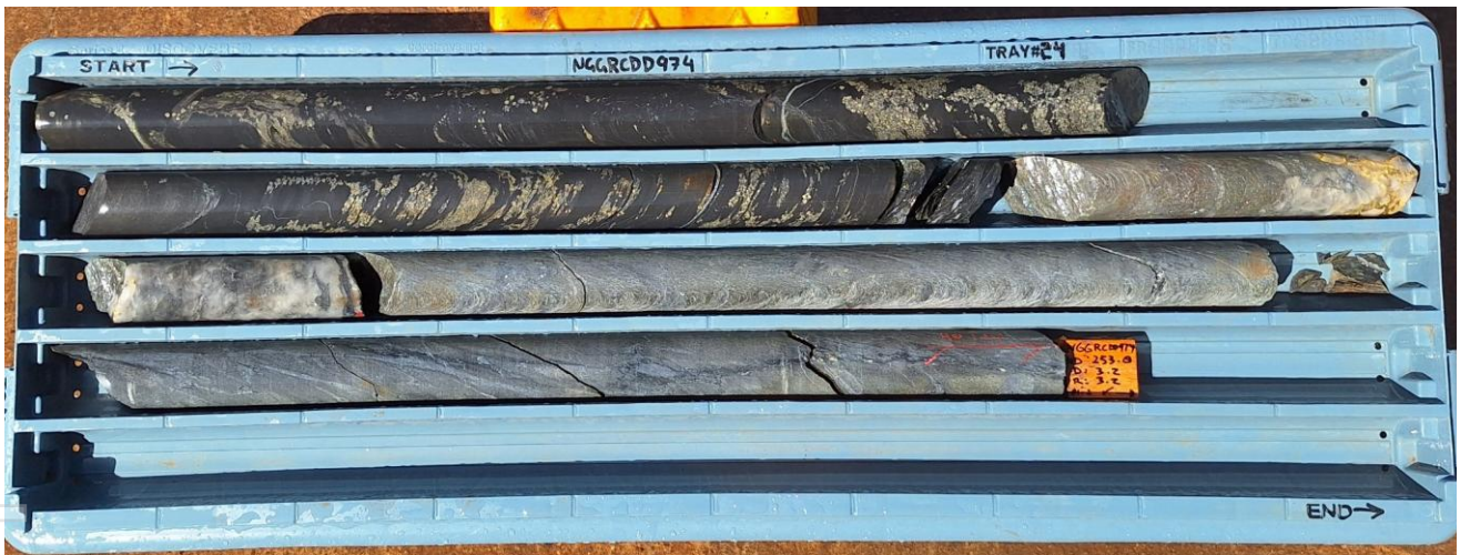
Tray 24 (249.91m – 253.11m) - Start shear zone, Raft of black shale, sheared and bleached mafic, quartz carbonate veins. Visible native gold in vein at 252m down hole. Veining and shearing continues.