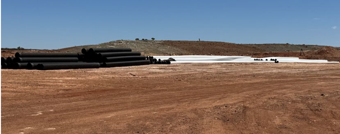
Figure 4: Dewatering pipes ready for installation to pump water from the Main pit to the evaporation ponds