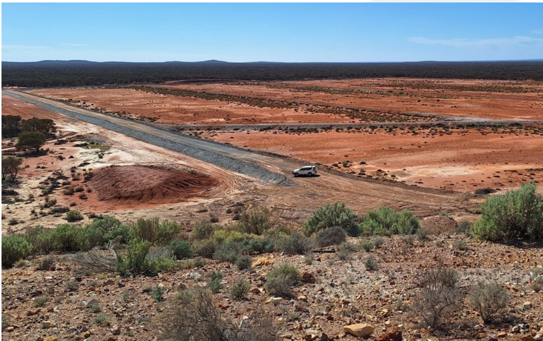
Figure 3: Completed buttressing of the northern wall of the Youanmi evaporation pond

ALS Perth have completed the comminution and flotation initial test work generating the concentrate required for the Albion Process™ test work, with the concentrate due to arrive at the Core Resources Laboratory in March, and initial results expected mid-year.