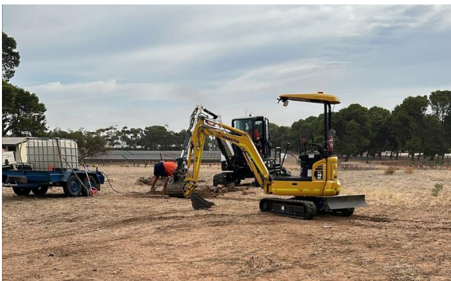
Figure 1: Site preparation activities, Roseworthy, South Australia

Commencement of pilot plant construction at the University of Adelaide's Roseworthy Campus follows several key milestones having been delivered by Sparc Hydrogen during Q1 2025 including manufacture of the linear Fresnel concentrated solar field in Europe (currently in transit), execution of an engineering, procurement and construction management (EPCM) contract with Incitias Pty Ltd, receipt of planning consent from the Light Regional Council and commencement of reactor manufacturing. In addition, Sparc announced the granting of the first patent for Sparc Hydrogen's exclusively licensed PWS reactor technology in January 2025.