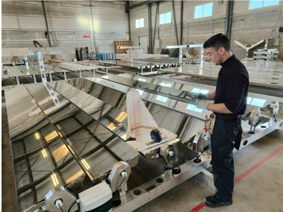
Figure 2: Factory based calibration of linear Fresnel solar field modules ahead of containerisation and shipping

"It is very rewarding to see progress being made both at Roseworthy and in the factory towards delivering a globally leading facility for green hydrogen production via photocatalytic water splitting. In an environment where major challenges exist for hydrogen projects due to the high cost of power, the requirement for new solutions to unlock low-cost green hydrogen without relying on electrolyzers has never been higher."