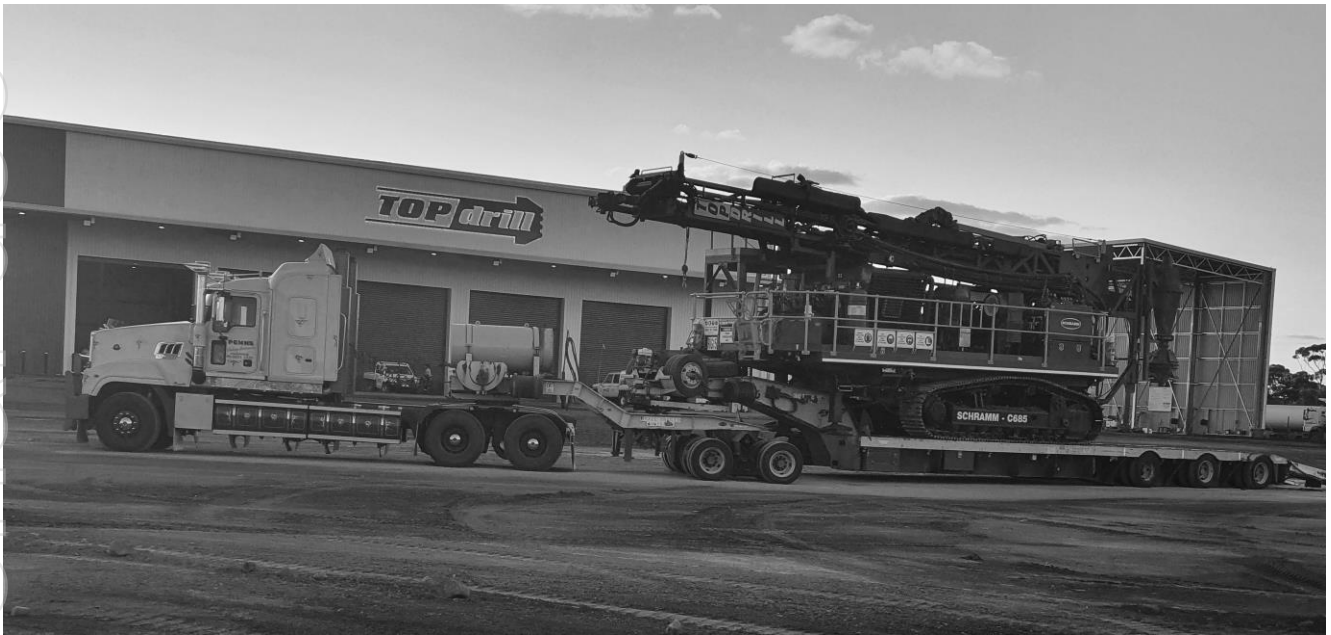
Figure 1: RC drilling rig being mobilised from Topdrill Kalgoorlie

The Company has now commenced its drilling program to test high-priority gold targets, focusing on extensions along strike and at depth beneath known gold workings and mineralisation along with additional gold potential across underexplored zones. This initiative is driven by previous sampling, which has identified new areas of mineralisation, further highlighting the area's strong gold prospectivity. With limited historical exploration beyond shallow depths, the program aims to uncover additional gold potential across the area. The planned program consists of approximately 30 drill holes for a total of at least 3,000 metres, marking a significant step in advancing the project.