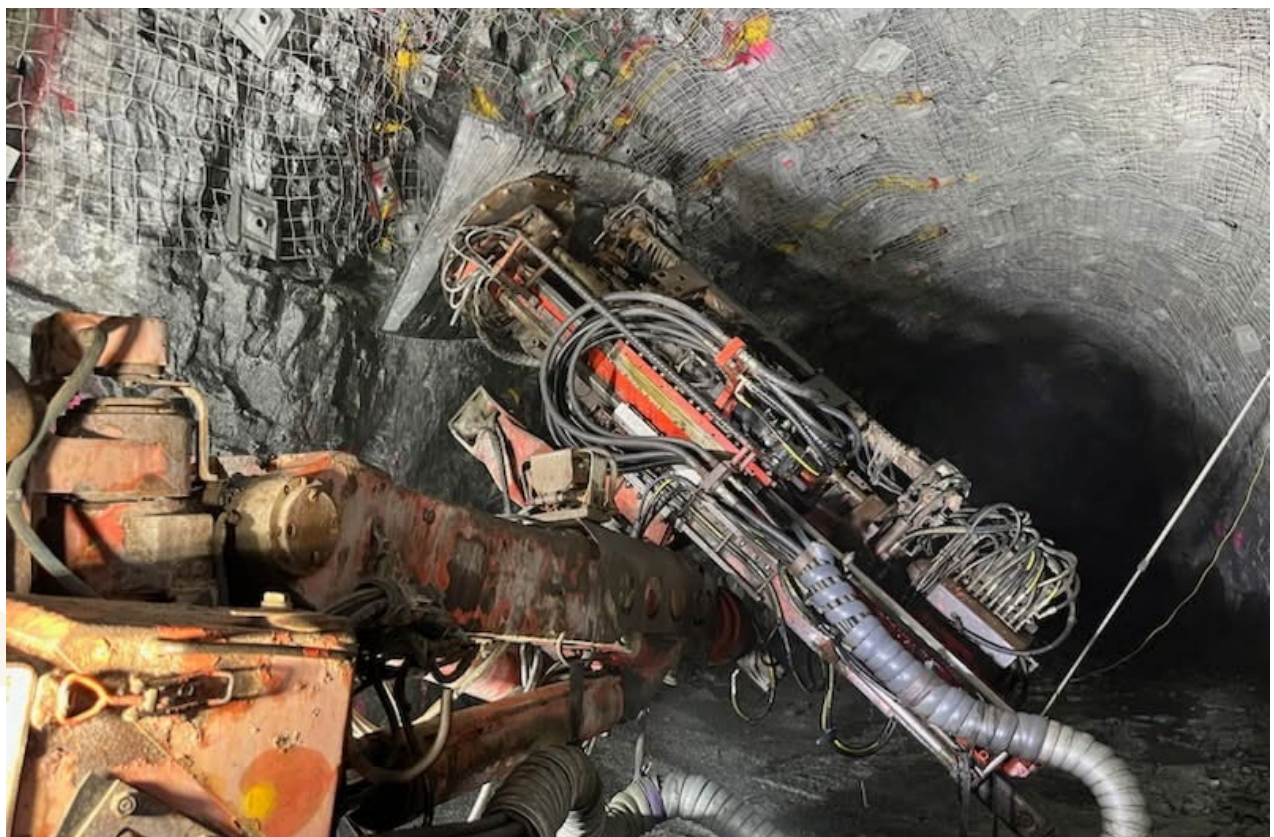
Figure 4: Drilling of the first production stope