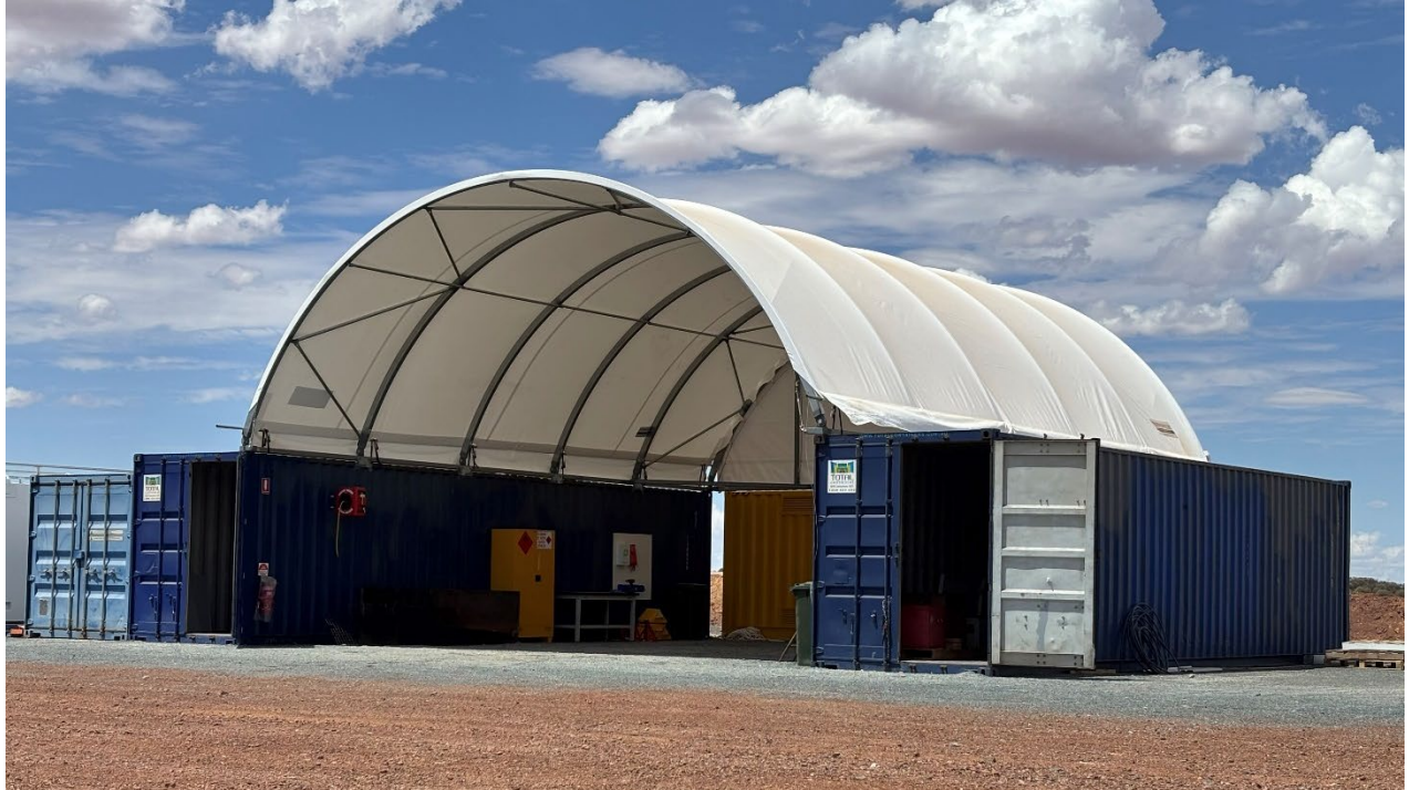
Figure 2: Plutonic East infrastructure includes a dome work shelter for daily maintenance

0.5Mt at 2.5g/t for 36koz1 of gold underpins Catalyst’s initial three-year mine plan with an additional year comprising Resources 2 .