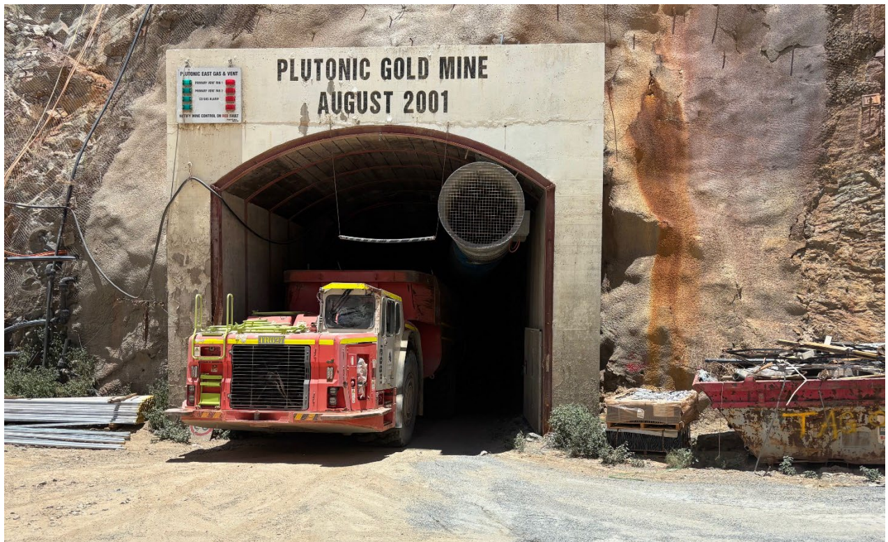
Figure 3: Plutonic East haul truck – shown at the Plutonic East portal