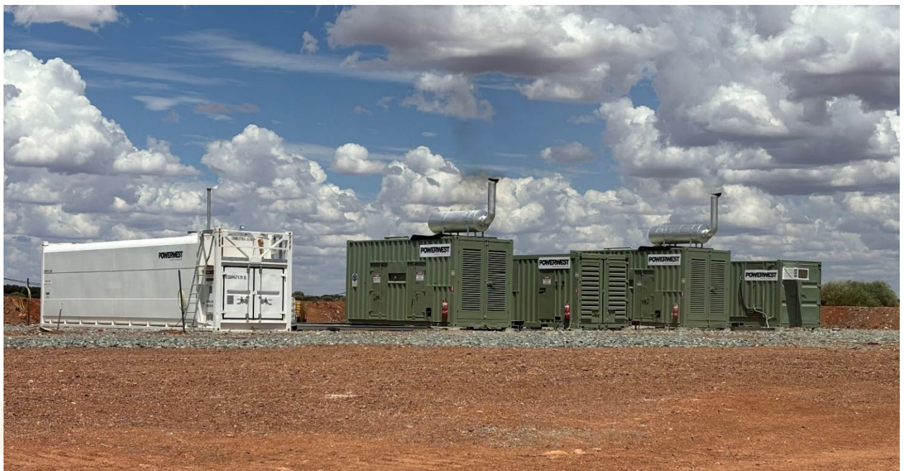
Figure 3: 2.8MW diesel power station recently commissioned