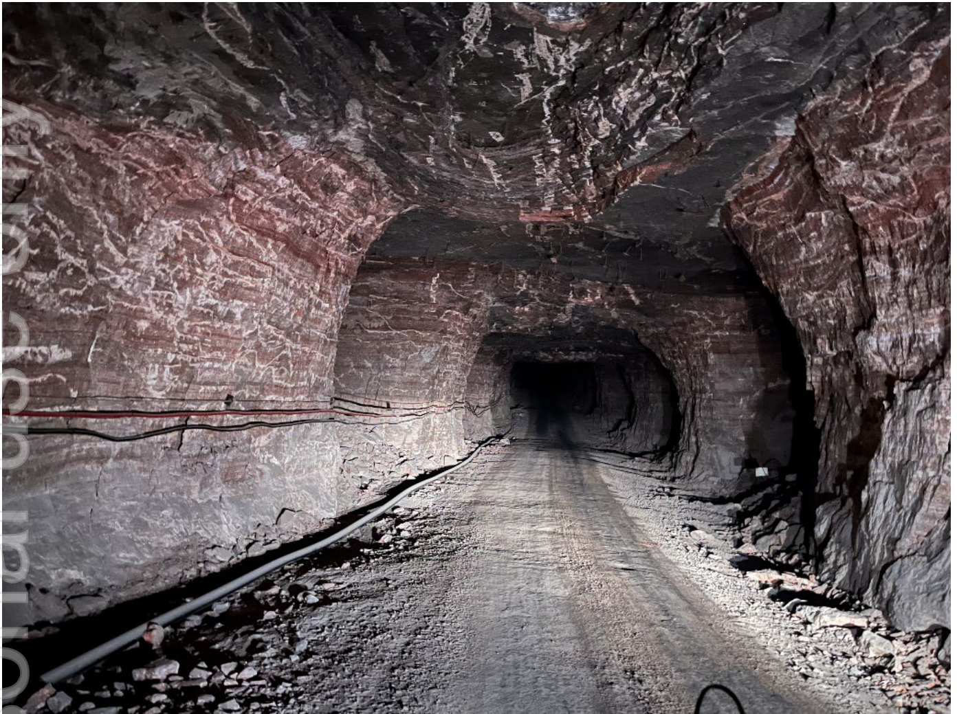
Figure 3: Potash ore seams at the Sollstedt mine