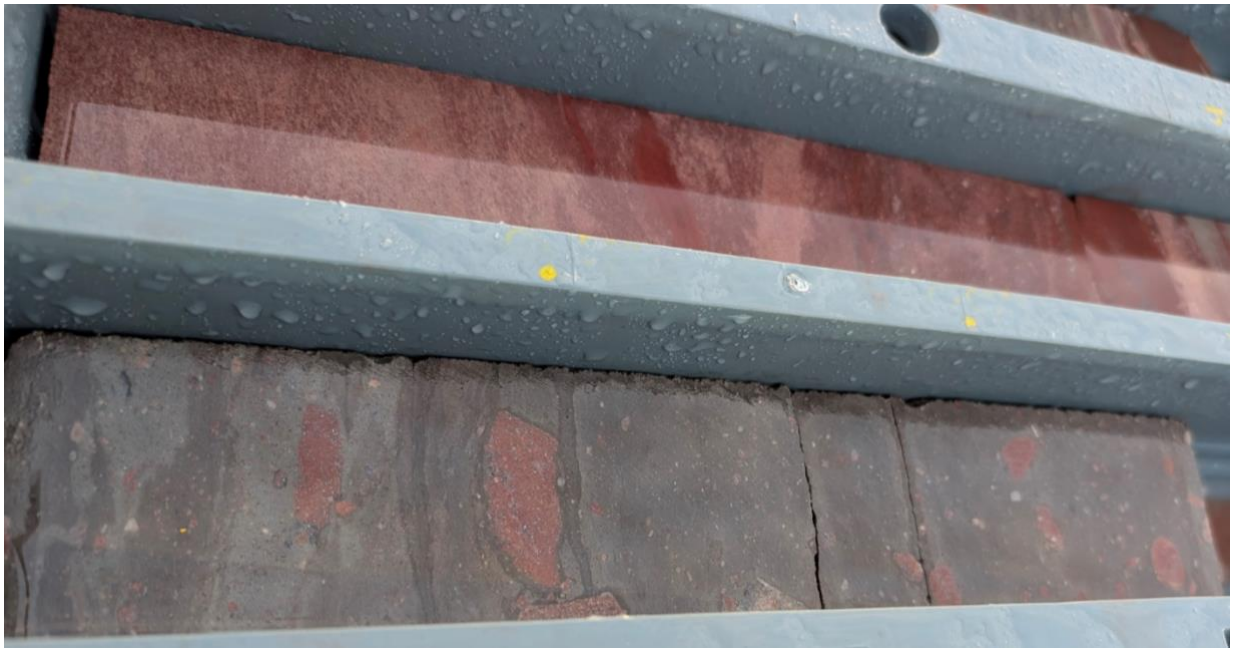
Figure 2 Reducing black mud supported conglomerate in drillhole DD25EB0038, moderately mineralised with disseminated chalcocite (see below Appendix 1 for more details and logging).