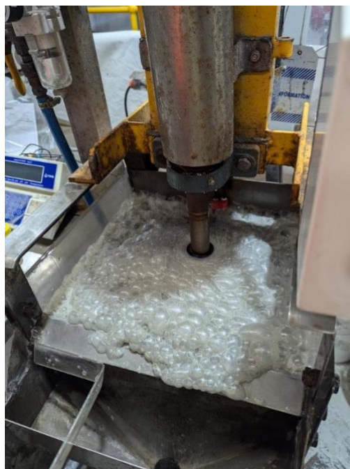
Figure 1: Bulk rougher flotation trial at ALS Metallurgy

Utilising preferred flotation parameters selected from the bench-scale rougher trials, a bulk rougher float was performed to prepare a concentrate sample for cleaner optimisation trials. The bulk rougher trials were performed in a 40L vessel, the testwork setup can be seen in Figure 1 . Two repeated trials validated conditions selected from the optimisation tests, achieving 69.5% CaF 2 at 98.0% recovery.