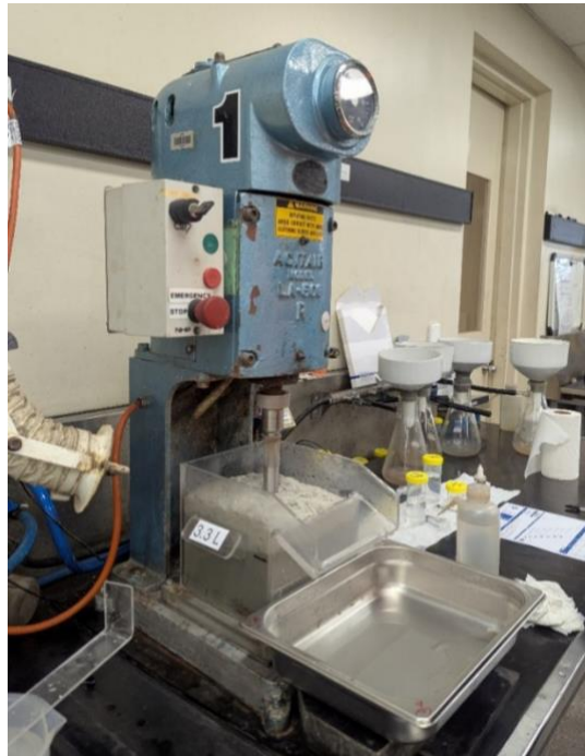
Figure 2: Cleaner flotation trial at ALS Metallurgy

The grade-recovery curves from optimised trial condition sets are presented in Figure 3 . The historic results from 2004 are included for comparison. The graph highlights the significant improvement in flotation kinetics and fluorite recoveries achieved in this program.