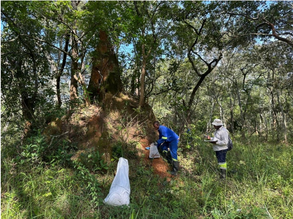
Figure 3: Termite hill geochemical sampling underway at Nyungu South Prospect

As Nyungu South is interpreted to represent the same geological and structural package as that characterised at Nyungu Central to the north, it has always been considered an important and prospective supplementary regional copper resource opportunity at Mumbeszi, due to its proximity to the flagship deposit. The re-interpreted Anglo IP and supporting Cu termite hill geochemical sampling provides for a compelling new drill target at Nyungu South, in much the same fashion as was defined and then successfully drilled by the Company at Kabikupa last year.