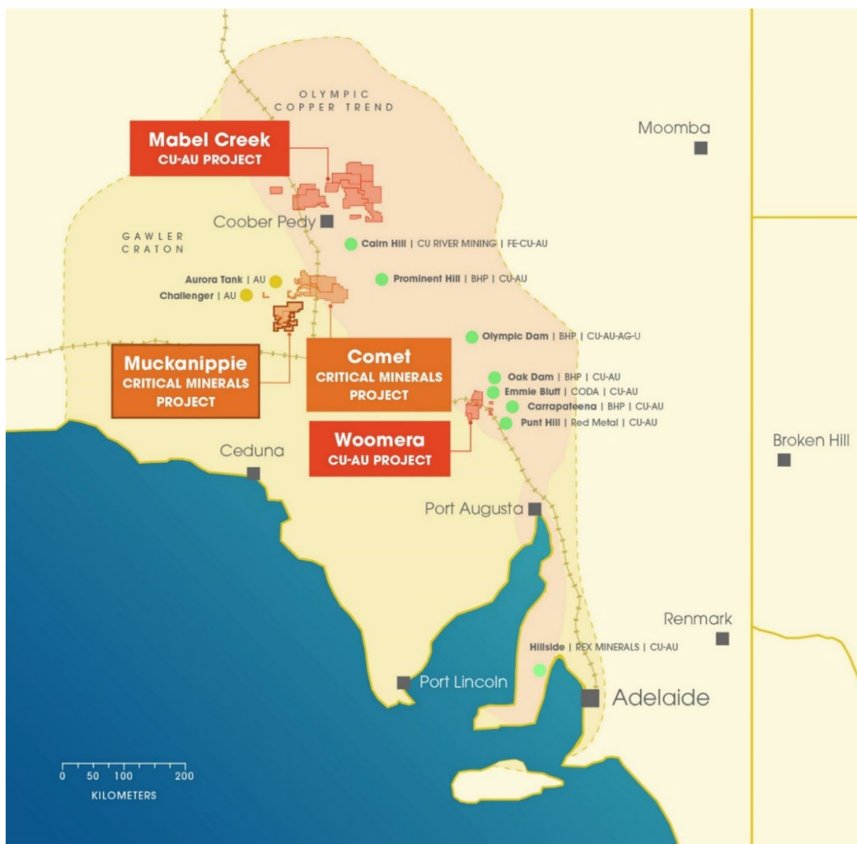
PTR's Project Locations in South Australia

The Company has two major exploration projects in the world-class Olympic Copper-Gold Province of South Australia. Work in the region has uncovered Iron-Oxide Copper-Gold style alteration/mineralisation at both its Mabel Creek and Woomera Project Areas. Geophysical targeting work has defined several compelling Tier-1 Copper-Gold targets which the Company is aiming to drill test during the 2025 calendar period.