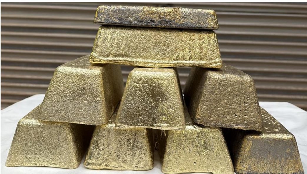
Figure 1 – Gold poured at the Laverton Mill from Second Fortune Mine and Lord Byron ore stockpiles