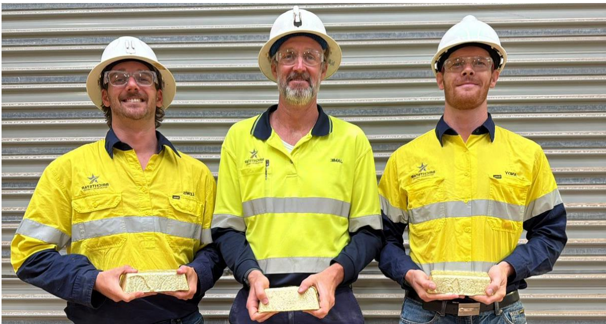
Figure 2 – Brightstar team present at maiden gold pour

With Brightstar's current production, additional near-term production and DFS study work imminent, the Company is firmly on track to deliver sustained production and value growth. Our team is excited about the upside we're building and we look forward to updating the market with the final reconciliations from the first parcel and on-going processing campaigns as we continue to grow our production."