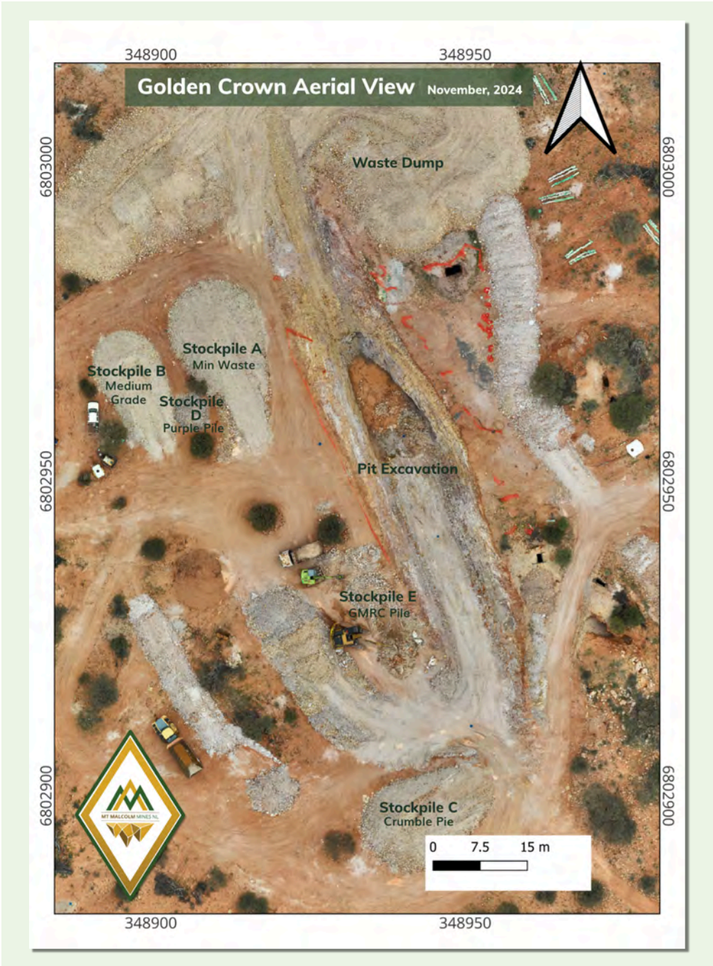
Figure 1. Aerial Image Showing Existing Stockpiles at Golden Crown as of November 2024.

In November 2024, LPD, a reputable surveying company, conducted LiDAR surveys and its results (see aerial image as Figure 1) serve as the primary basis for the volume estimates of the stockpiles.