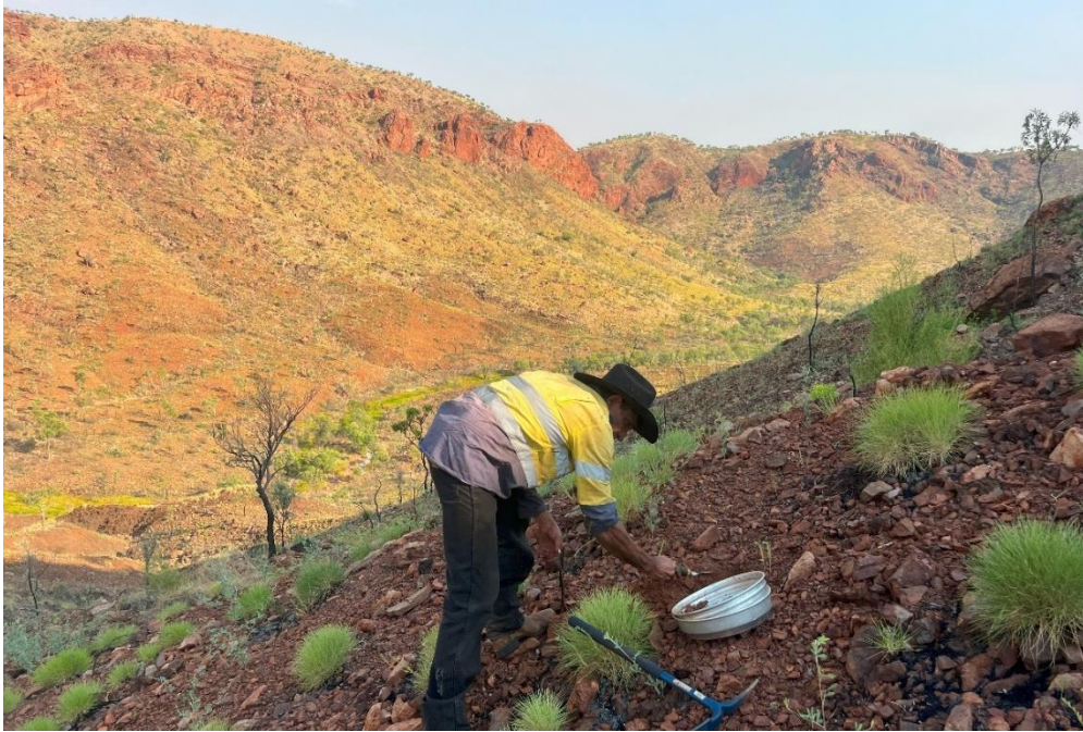
Figure 2 – Purnululu monitors on-site assisting with soil sampling at the Ord Basin Project.