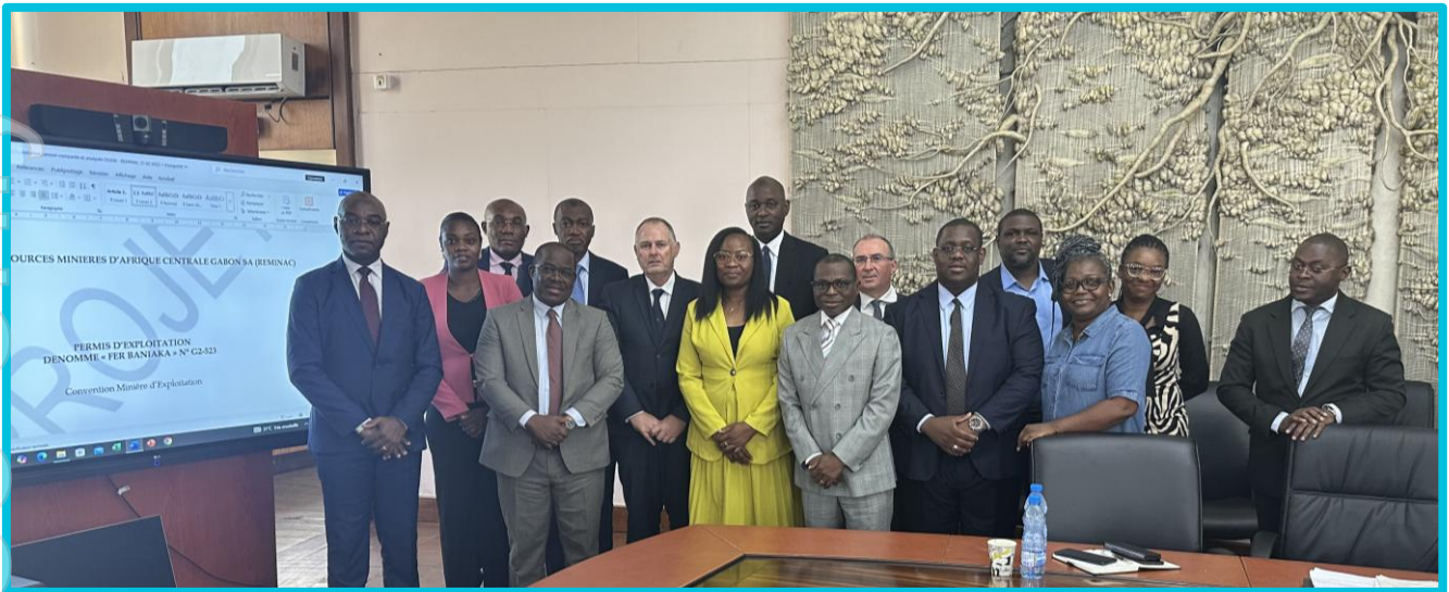
Figure 2: The joint negotiating team for the Baniaka Mining Convention at the end of the final working session in Libreville, comprised of representatives from Genmin, its legal advisors, and Gabon’s Ministry of Mines and Ministry of Economy.