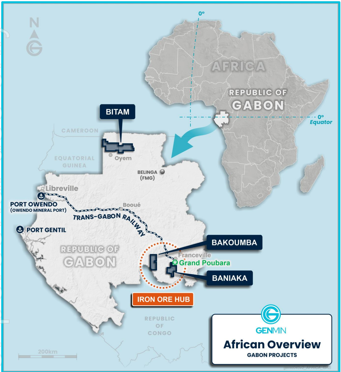
Figure 1: Location map of Genmin's projects in Gabon