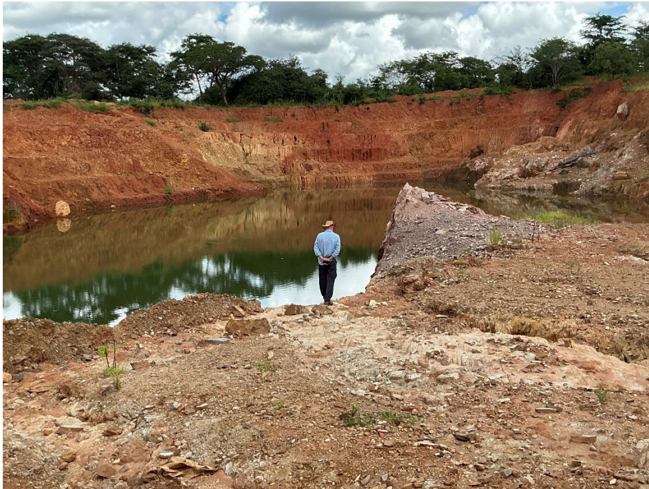
Figure 2: Chimban South Pit

The area is hosted by Neoproterozoic to early Paleozoic metasedimentary rocks of the Katanga Supergroup in the vicinity of late-tectonic syenite plutons. Copper mineralisation occurs along regional-scale lineaments, following mainly a NNW-SSE trend defined by the Mumbwa Fault Zone. Work to date has identified two small scale pits 150m from our licence boundary showing oxidized quartz-carbonate copper bearing metasandstone unit approximately 12.0m-14.0m wide, 220m long, striking NW-SE and vertical. Mineralisation is mainly in the form of malachite, chalcopyrite and bornite. Strike extension of the mineralised body was confirmed inside our licence by a historical diamond drill hole, still visible on the ground. We are working on getting access to the drill core and confirm intersections.