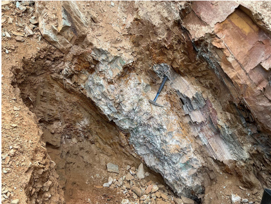
Figure 3: Quartz-calcite vein with malachite on CBR South

Handheld XRF readings from one of the copper bearing veins indicated high copper readings with sample R3510 recording 33.08% Cu and averaging 12.19% Cu , see Appendix.