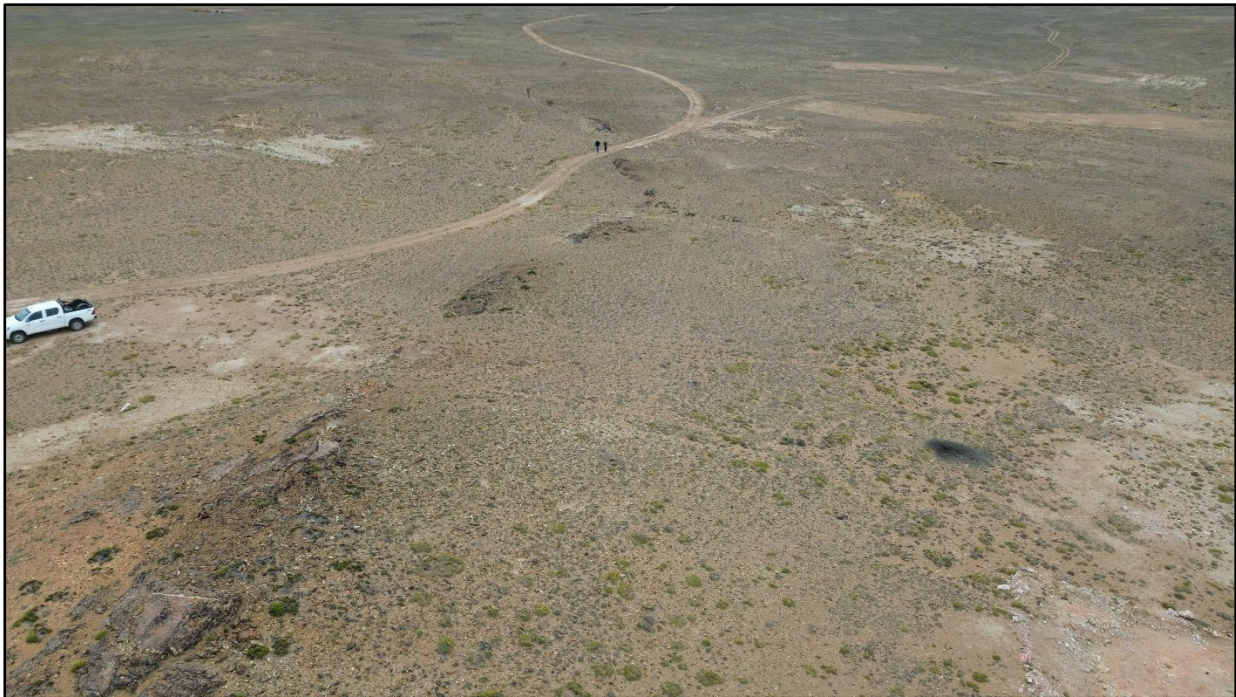
Figure 2: Geologists walking the kilometre scale surface expression of the Fresia target - Aguila South prospect.