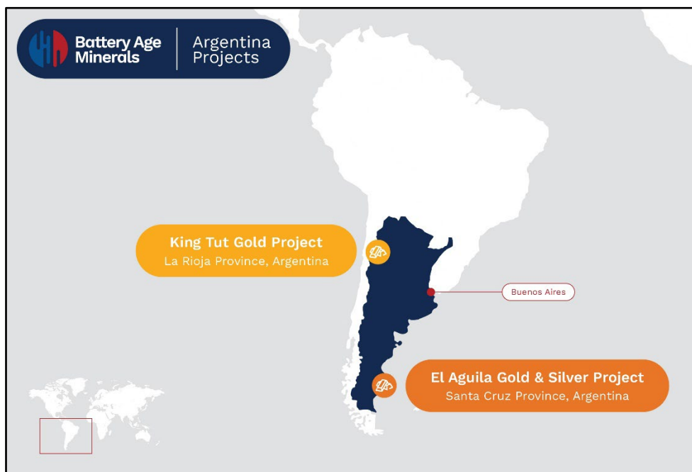
Figure 3: Battery Age Minerals, Argentinian Gold and Silver Projects

The El Aguila Project is strategically located within an established mining jurisdiction, surrounded by multiple producing gold-silver operations and supported by excellent regional infrastructure. Historical exploration results confirm the presence of high-grade mineralisation, with substantial upside potential from underexplored and untested targets across the 9,124-hectare landholding.