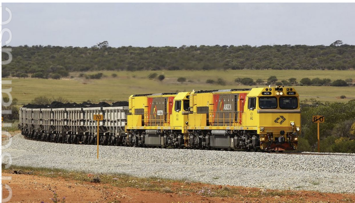
Figure 5 – Magnetite concentrates will be loaded on to dedicated ore trains at proposed Hillgrange intermodal facility for transport to port (stock image).