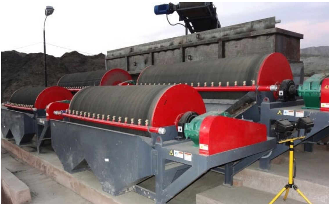
Figure 4 – Conventional magnetite beneficiation technologies will be used for ore processing including wet magnetic separation (stock image).