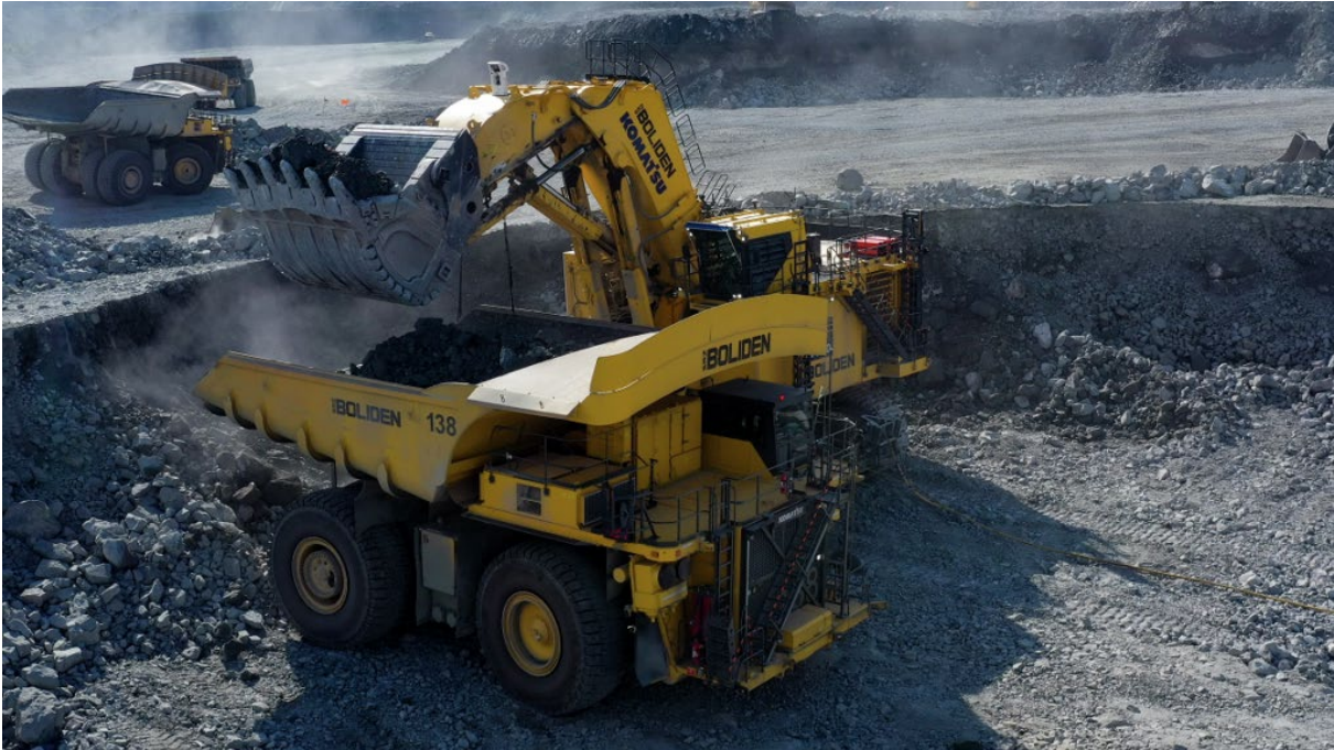
Figure 3 – Conventional open pit mining operations will be used to mine the Iron Peak and Razorback ore deposits over an initial 38-year mine life (stock image).