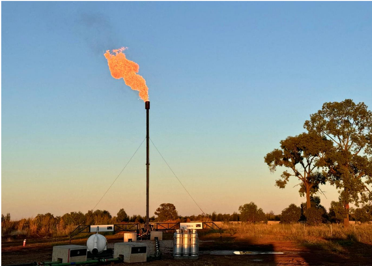
Figure 2: Flare while flow testing Canyon-1H well

The Canyon-1H well is now shut in. Wellhead pressure buildup is being monitored while evaluation of well results is ongoing. Rapid wellhead pressure buildup rate provides further evidence of favourable reservoir conditions. The well may be re-opened in future for extended production testing if desired.