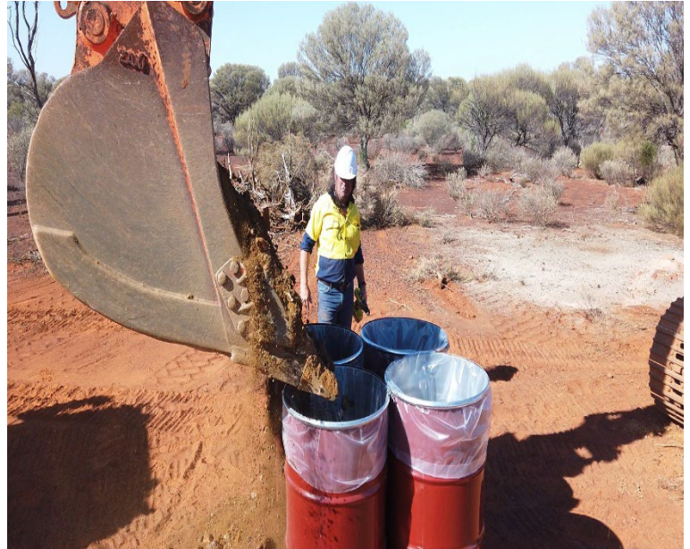
Mt Kilkenny bulk sample collection and storage

Sub-samples were collected from each drum and prepared for analytical analysis at SGS Perth by X-ray Fluorescence (XRF) as detailed in table 1. Sufficient drums to make a 600kg sample containing a geochemical composition that resembled the expected LOM grades were selected for use in the closed-circuit testing program. The contents of the selected drums were crushed to the required ore feed size of minus 50mm and homogenised prior to being agglomerated with 98% sulphuric acid and loaded into the columns for leaching.