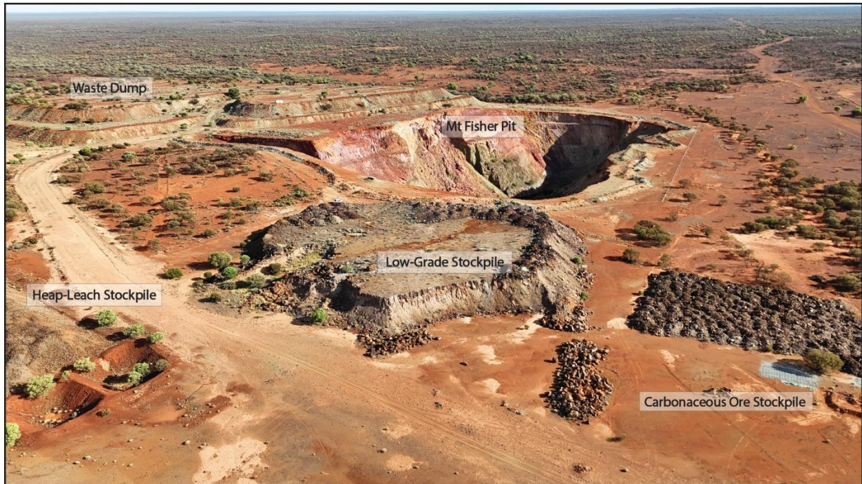
Figure 1- Image looking north-west showing historical pit, waste dumps and stockpiles