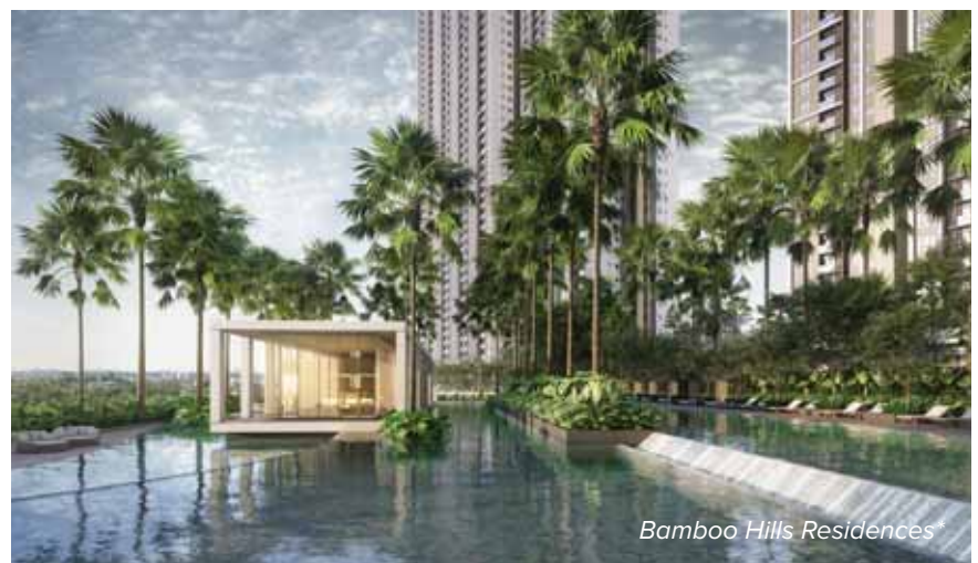
Bamboo Hills Residences*