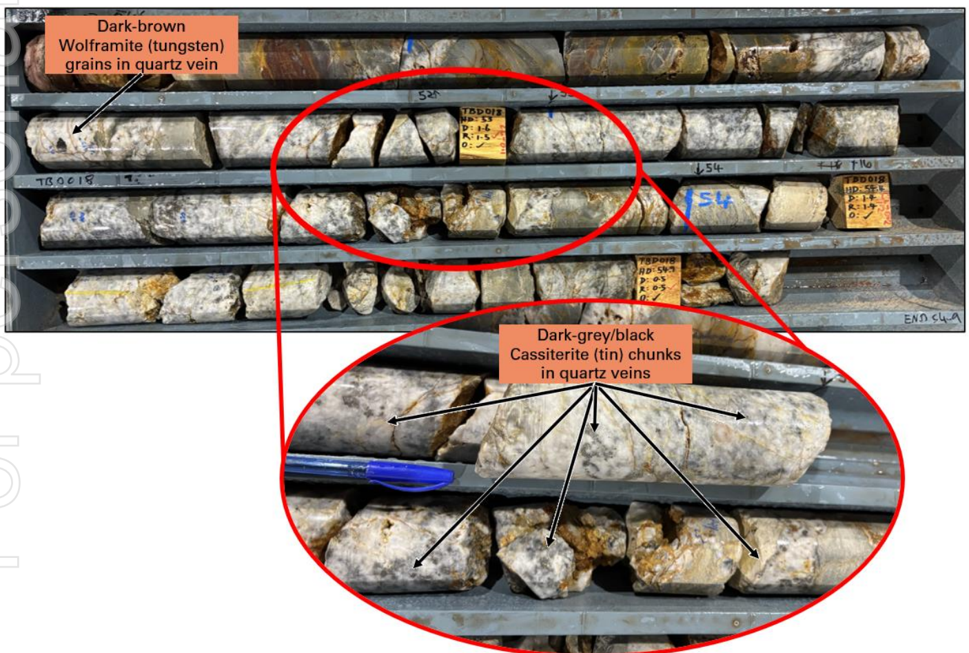
Figure 3: Top: Photo of HQ drill core in core trays from diamond drill-hole TBD018 with wide quartz-cassiterite (tin) veining shown between ~51.6m-54.9m and wolframite (tungsten) grains. Bottom insert: Magnification of the strongly mineralised vein at ~53m and 53.8m where abundant, large cassiterite (tin) chunks are visible in the core as dark grey/brown/black zones in quartz and iron-oxide veins. NB: Cassiterite is 78.7% tin – assays are pending.

TBD018 intersected a shallow, wide quartz veined interval hosting abundant cassiterite (tin-oxide) throughout with grains of wolframite (tungsten) observed, typically associated with the tin mineralisation at Tallebung (Figure 3).