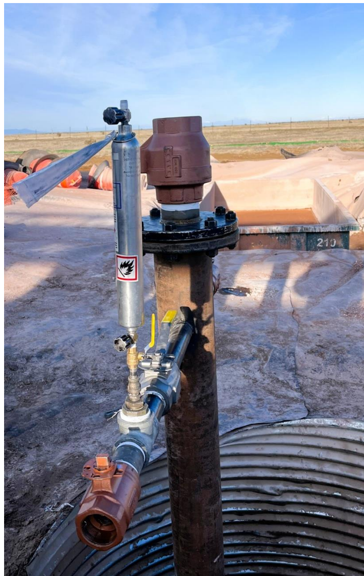
Well-head testing at Jackson 4 well, Galactica Project

Blue Star Helium Limited (ASX:BNL, OTC:BSNLF) ( Blue Star or the Company ) is pleased to announce initial results from the Jackson 4 L4 3154 development well at its Galactica helium project in Las Animas County, Colorado.