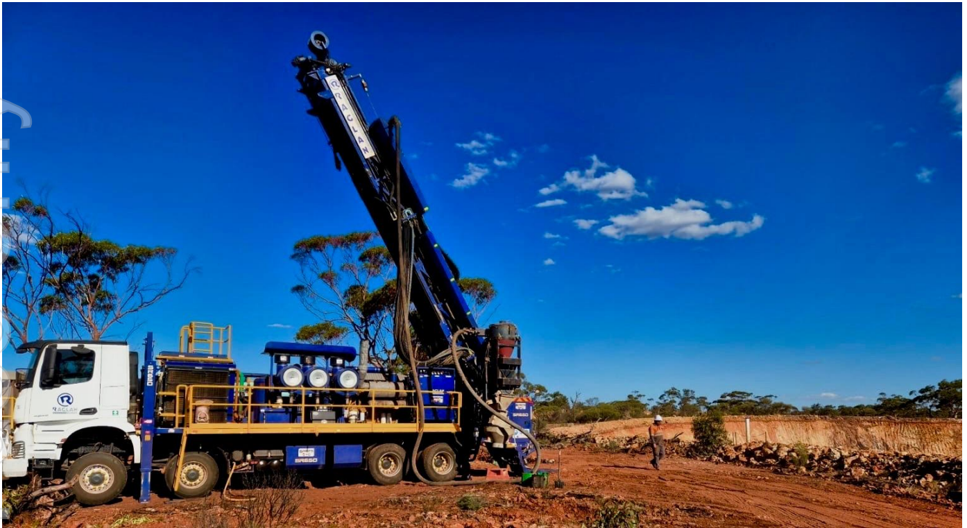
Figure 1 RC drill rig mobilised at Marda Central, April 2025.