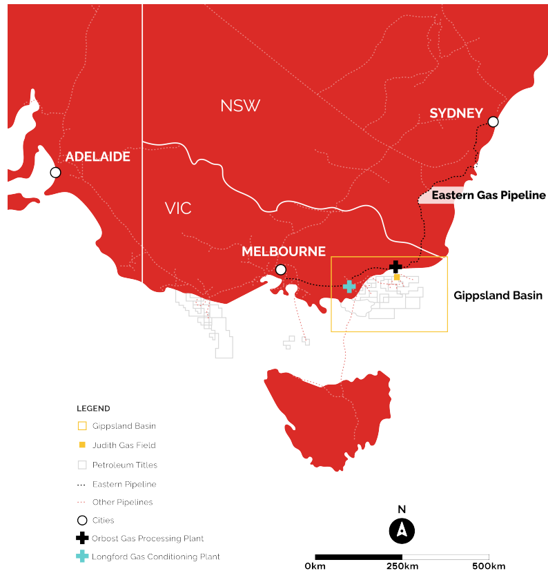
Figure 1: Gippsland Basin, Bass Strait