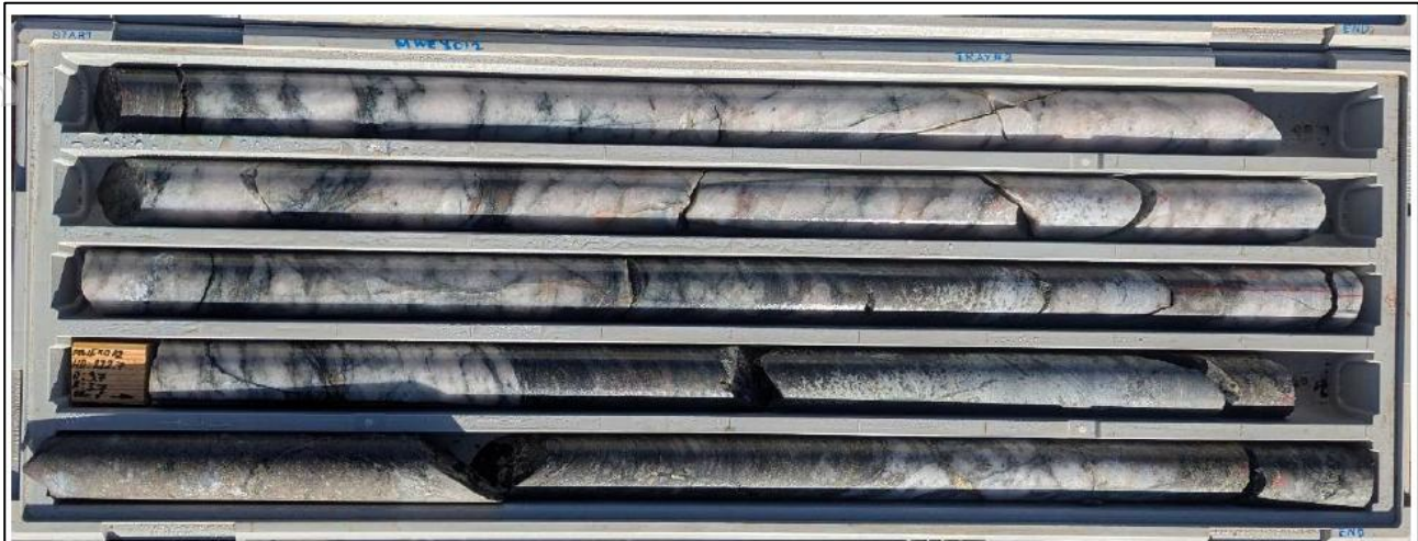
MWEX012, 220 – 223m Massive QTZ vein. Diss sulphides