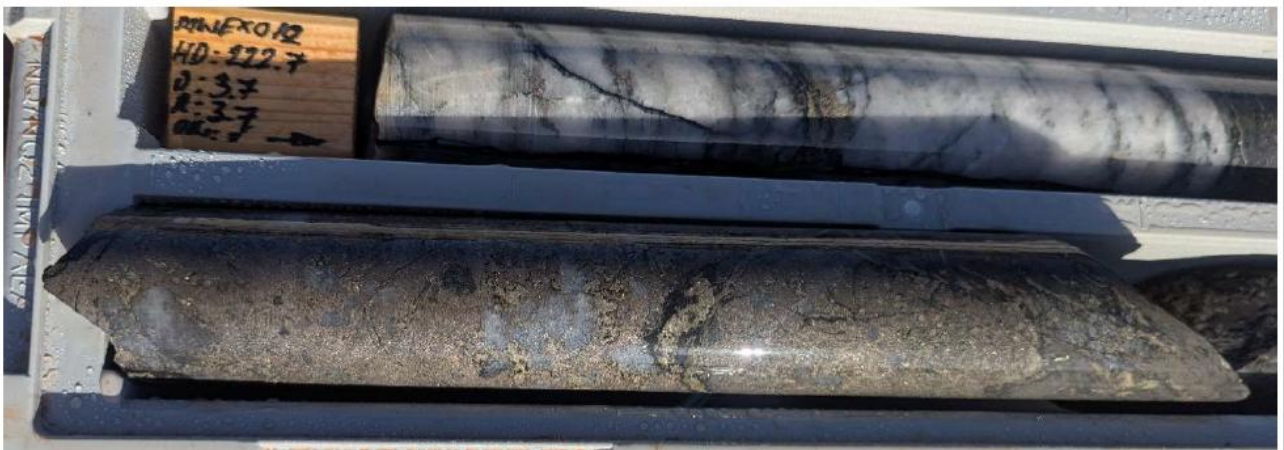
MWEX012, 223.5 – 225m Massive sulphides. Into major carbonate/ QTZ veining.

Figure 3 Photo of quartz veining with associated sulphide in MWEX012 (note: Assay results for the diamond portion of MWEX012 are not yet received, GG8 provides no guidance on estimated gold grade, there is no 1:1 correlation between gold grade and sulphide percentage, the interval 220-224 averaged 85% quartz-carbonate vein by volume, 5% biotite alteration, 5% pyrrhotite 5% altered country rock)