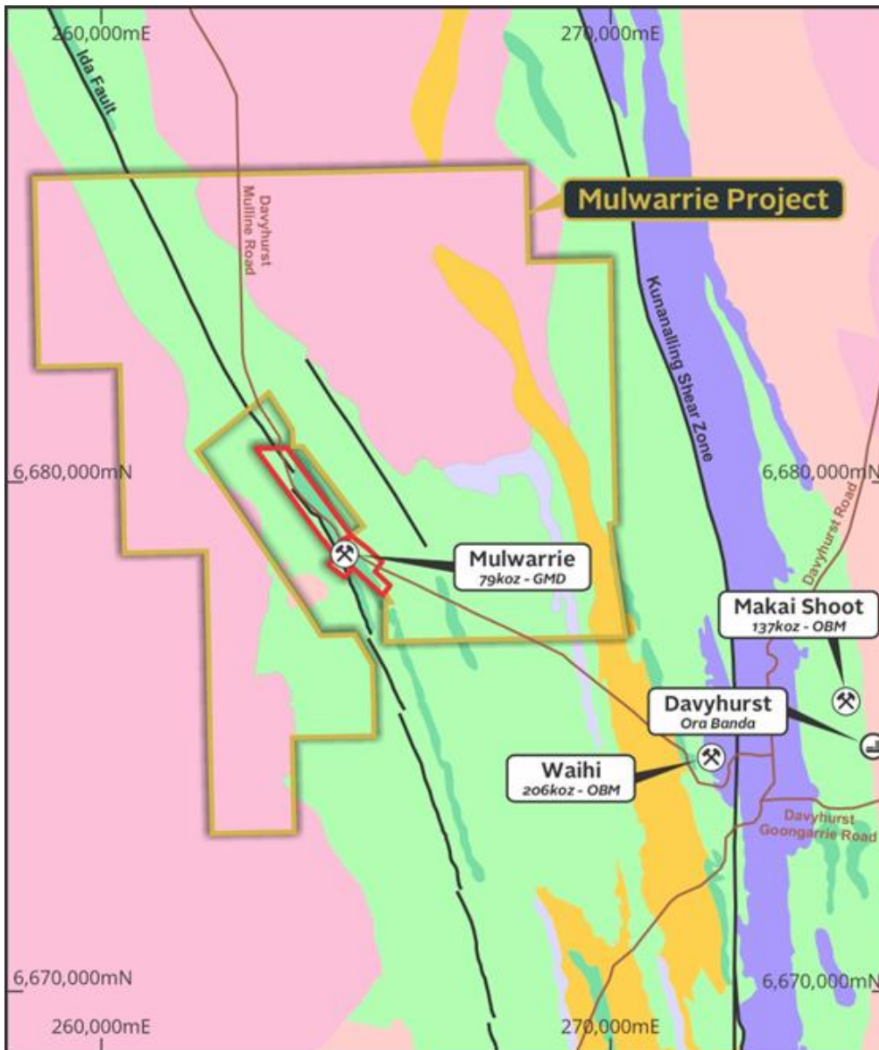
Figure 2 Location of Mulwarrie

Drilling activities reported in this release are an update on the framework drilling from Gorilla’s rapid resource growth campaign at Mulwarrie.