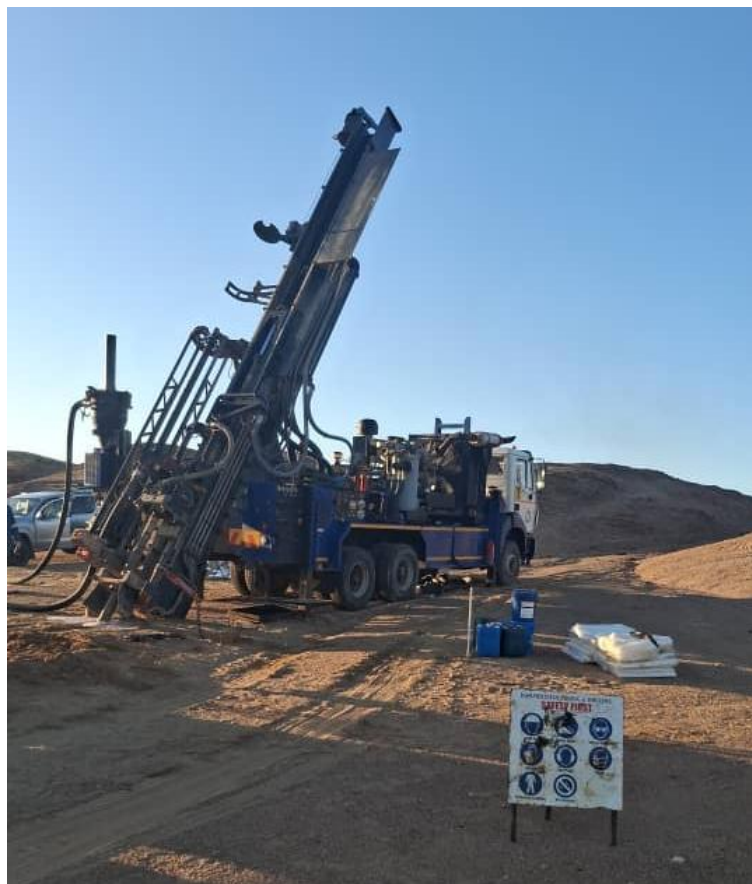
Figure 1. Drilling is underway at the Etango North-East Project