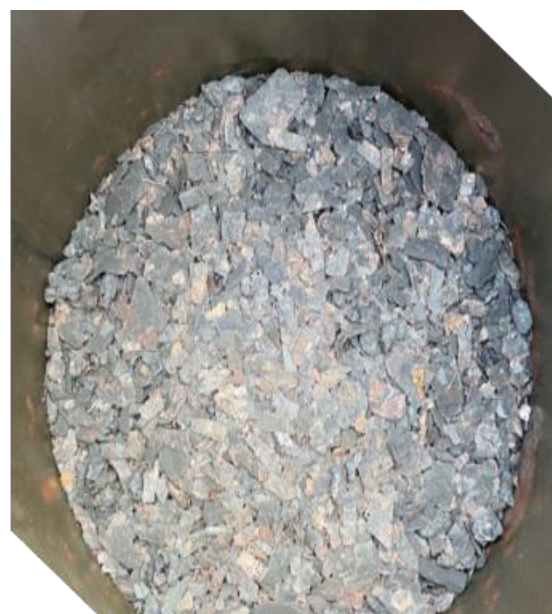
Figure 1: Photo of (L) original E-Waste printed circuit board waste & (R) metal rich char (E-Waste with plastics removed by separate process)