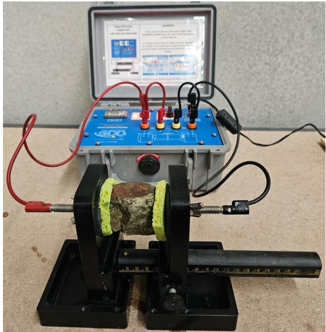
Figure 1: Prince Of Wales prospect sample RK008302 10.15% Cu and 65.8g/t Ag 2 , being tested for Induced Polarisation, chargeability, galvanic resistivity and inductive conductivity