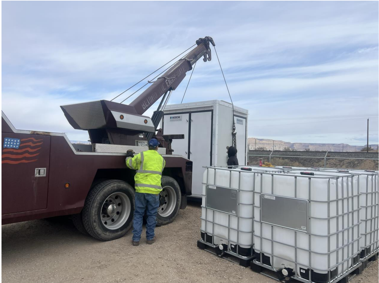
Picture 1: Removal of the Koch Technical Services DLE Pilot Plant from the SDP at Green River

The KTS DLE pilot plant has been removed from the Green River Sample Demonstration Plant to enable the installation of the polishing plant at the SDP, See Picture 1.