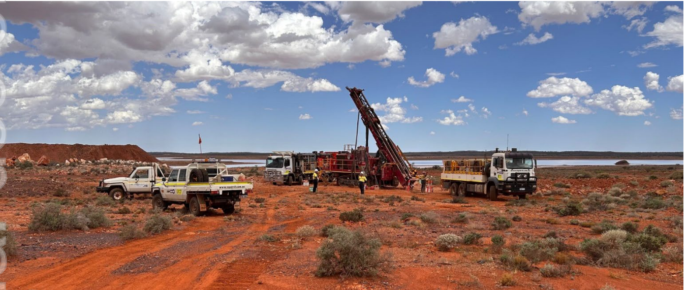
Figure 1. Topdrill track mounted RC23 drilling at the Island Gold Project February 2025.

"We are pleased to enter into this drill-for-equity agreement which highlights the mutual recognition of the superior drilling services which Topdrill provide and the potential Caprice Resources equity appreciation that could occur with ongoing successful exploration. This agreement offers a capital-effective method to increase our drilling programmes across Caprice's exciting gold projects in the Murchison Goldfields."