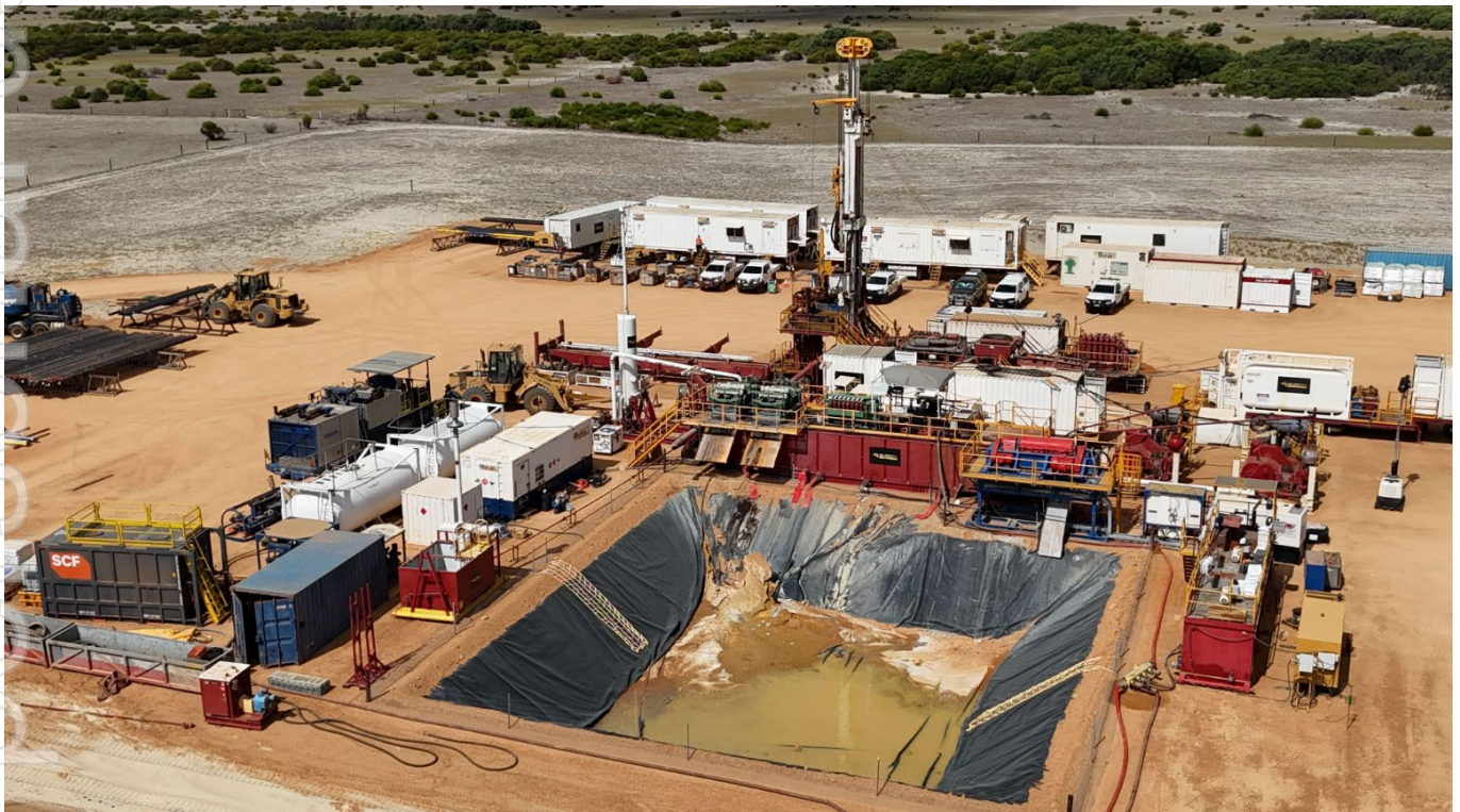
Figure 1: Drilling Rig on Becos-1 location

Becos-1 is being drilled by the EP 437 Joint Venture, comprising subsidiaries of Triangle as Operator 50%, Strike Energy Ltd (ASX:STX) 25% and Echelon Resources Ltd (ASX:ECH) 25%.